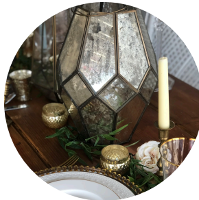
Lantern, candles, table numbers