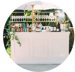
Backdrops, bars, shelves and more