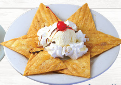
Sopapilla with Ice Cream

A flour tortilla stuffed with Hershey's chocolate deep fried to golden brown and topped with sprinkled cinnamon, strawberry topping and a scoop of ice cream. 5.99