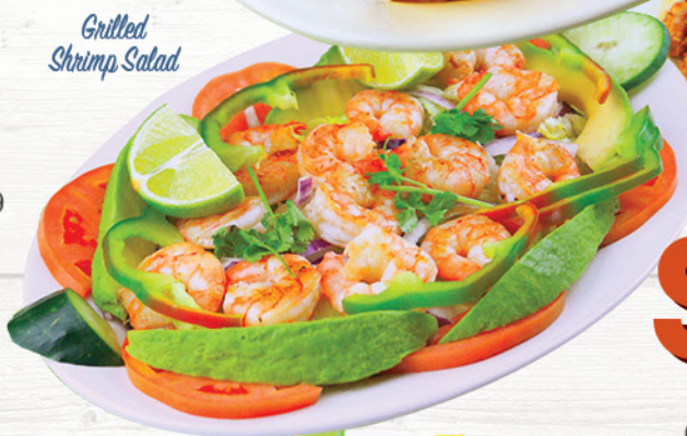
Grilled Shrimp Salad

Lettuce, tomato, onion, bell pepper, shredded cheese, topped with seasoned grilled chicken. 10.99