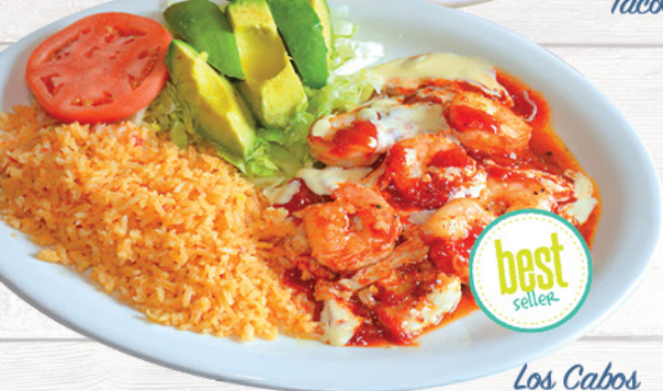
Los Cabos Special