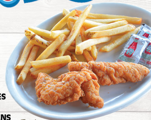
Tenders & Fries