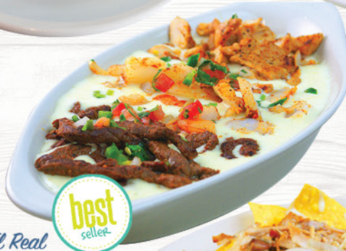
El Real Dip