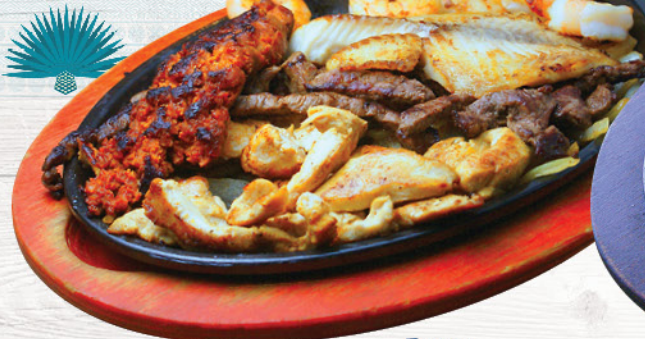
Fajitas Mar y Tierra