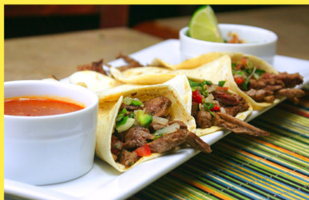
Tacos de Carne Asada