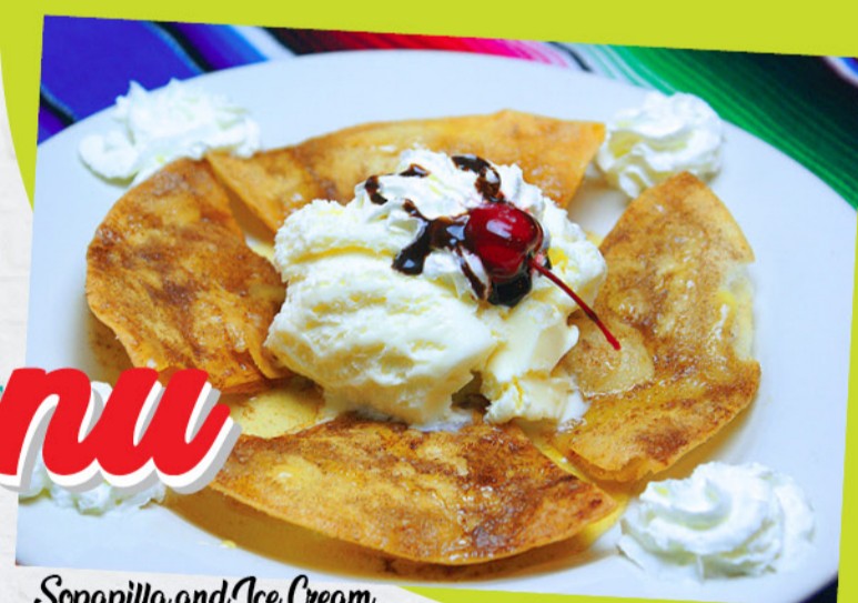
Sopapilla and Ice Cream