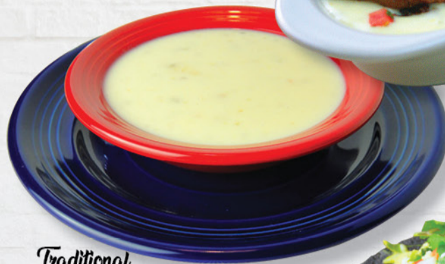
Traditional Cheese Dip

Our special nacho plate! Chicken, ground beef, and beans topped with lettuce, cheese, tomatoes, sour cream and guacamole