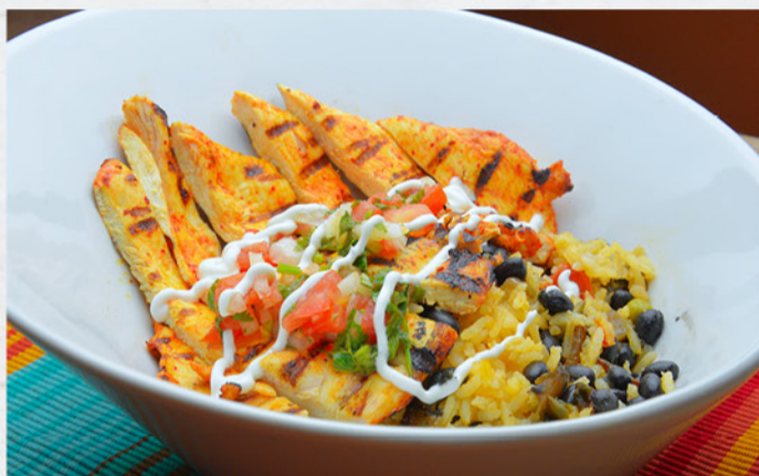
Casa Fiesta Bowl