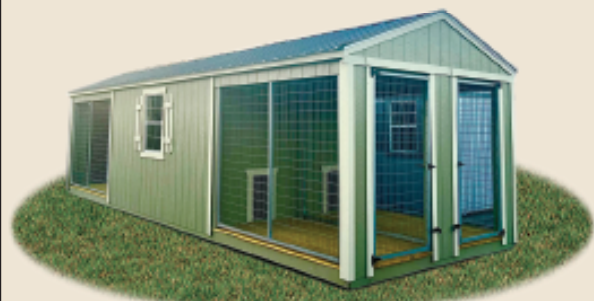
Shown with additional Dog Run

Our dog kennel is the perfect outdoor - indoor place for your dog while you are at work. The dog kennel comes standard with one 3' man door with transom window, one 3' kennel door entrance, and one 2x3 window.