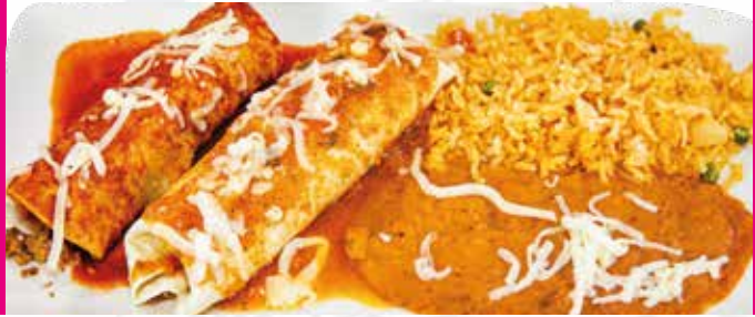
Enchilada Burrito Rice and Refried beans

Can be made supreme (add lettuce, tomatoes, and sour cream) for 3.00.