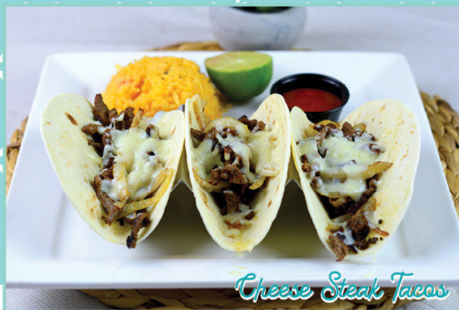
Cheese Steak Tacos

Three corn tortilla stuffed with marinated pork, pineapple and citrus juices, fresh cilantro, onions and tomatillo sauce. 16