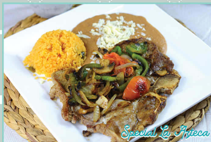
Special La Azteca

Grilled chicken strips with Mexican sausage, cheese dip on top served with rice, beans and tortillas. 16