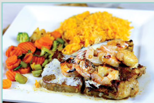
Steak and Shrimp