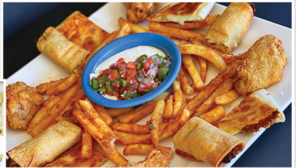
TEQUILA SAMPLER Chicken Wings, french fries, cheese quesadilla, taquitos and pico sour cream dip. 15