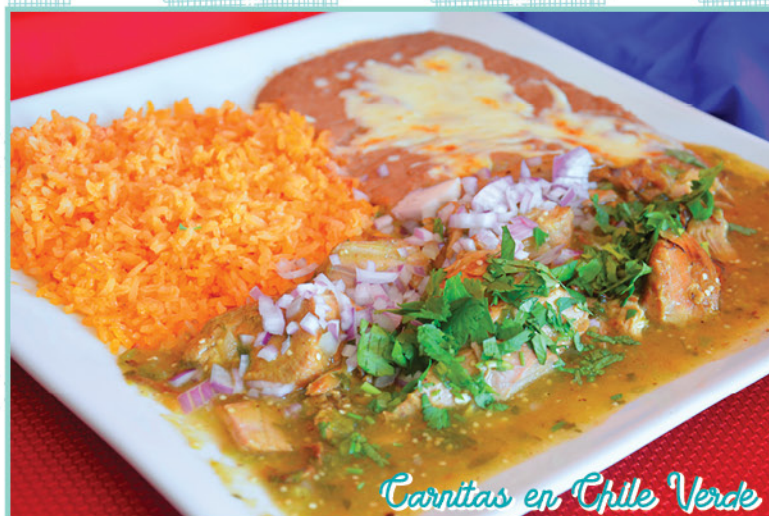
Carnitas en Chile Verde