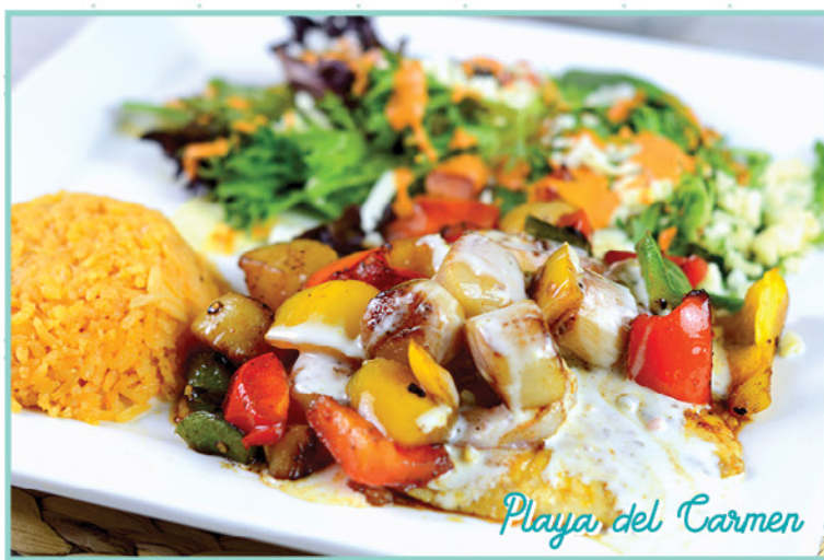
Playa del Carmen

*NOTICE: FOODS COOKED TO ORDER, CONSUMING RAW OR UNDERCOOKED MEATS, POULTRY, SEAFOOD, SHELLFISH OR EGGS MAY INCREASE YOUR RISK FOR FOOD BORNE ILLNESSES, ESPECIALLY IF YOU HAVE CERTAIN MEDICAL CONDITIONS. TO OUR GUESTS WITH FOOD SENSITIVITIES OR ALLERGIES: WE CANNOT ENSURE THAT MENU ITEMS DO NOT CONTAIN INGREDIENTS THAT MIGHT CAUSE AN ALLERGIC REACTION.