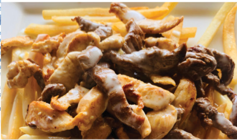
TEQUILA FRIES French fries topped with steak, grilled chicken and queso dip. 14