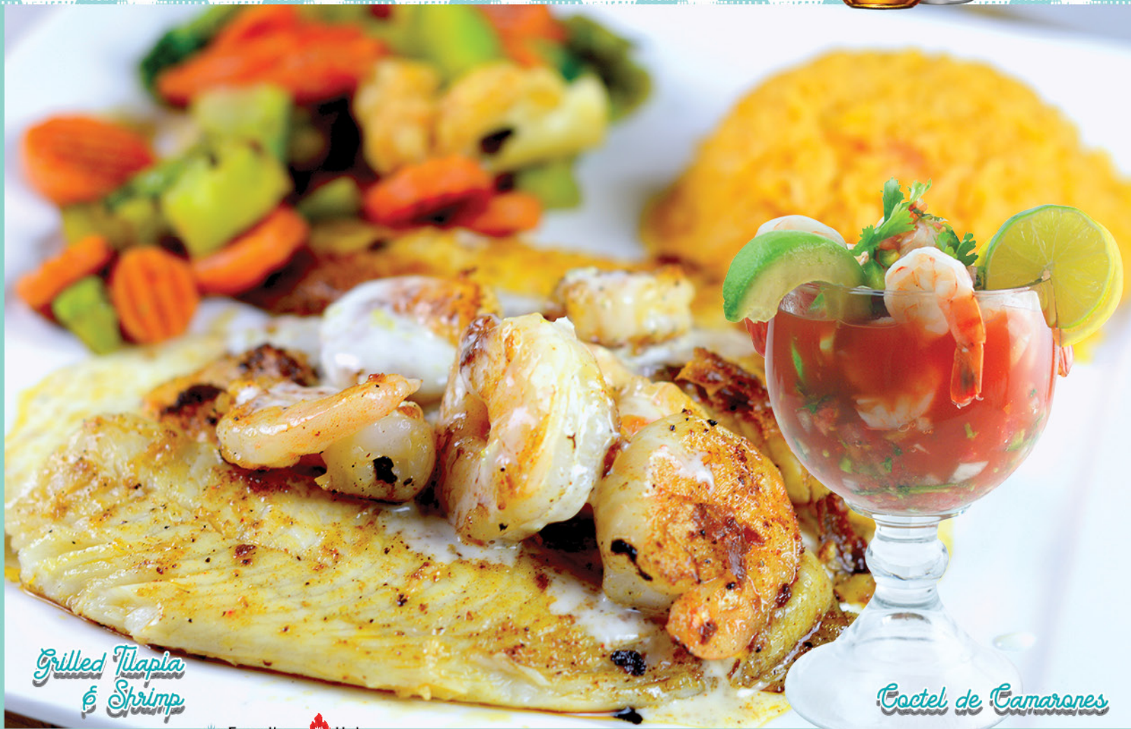
Grilled Tilapia & Shrimp