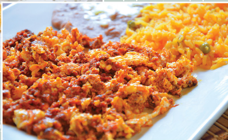
Huevos con Chorizo