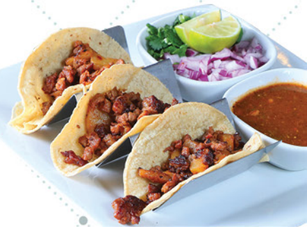
Tacos al Pastor

*NOTICE: FOODS COOKED TO ORDER, CONSUMING RAW OR UNDERCOOKED MEATS, POULTRY, SEAFOOD, SHELLFISH OR EGGS MAY INCREASE YOUR RISK FOR FOOD BORNE ILLNESSES, ESPECIALLY IF YOU HAVE CERTAIN MEDICAL CONDITIONS. TO OUR GUESTS WITH FOOD SENSITIVITIES OR ALLERGIES: WE CANNOT ENSURE THAT MENU ITEMS DO NOT CONTAIN INGREDIENTS THAT MIGHT CAUSE AN ALLERGIC REACTION.