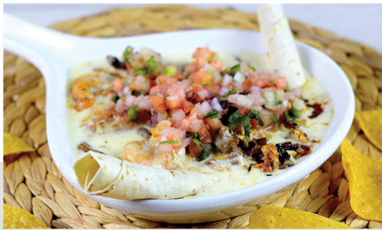
TEXAS DIP Grilled chicken, steak, shrimp and pico de gallo topped with queso dip. 11