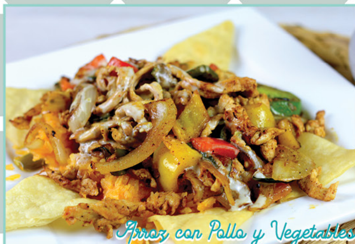
Arroz con Pollo y Vegetables

*NOTICE: FOODS COOKED TO ORDER, CONSUMING RAW OR UNDERCOOKED MEATS, POULTRY, SEAFOOD, SHELLFISH OR EGGS MAY INCREASE YOUR RISK FOR FOOD BORNE ILLNESSES, ESPECIALLY IF YOU HAVE CERTAIN MEDICAL CONDITIONS. TO OUR GUESTS WITH FOOD SENSITIVITIES OR ALLERGIES: WE CANNOT ENSURE THAT MENU ITEMS DO NOT CONTAIN INGREDIENTS THAT MIGHT CAUSE AN ALLERGIC REACTION.