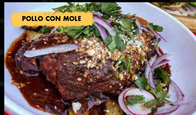
POLLO CON MOLE