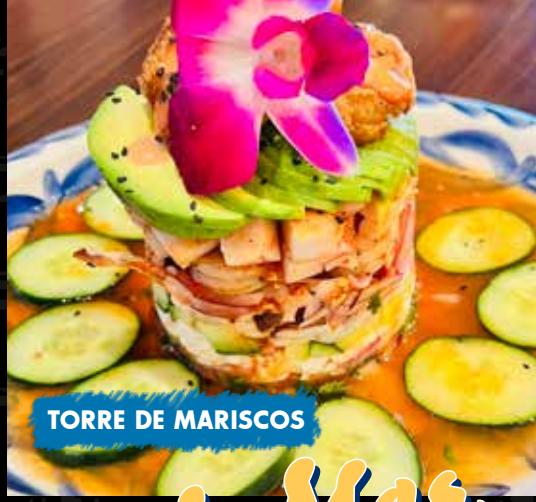
TORRE DE MARISCOS