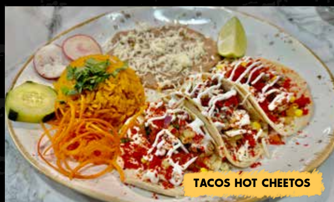
TACOS HOT CHEETOS