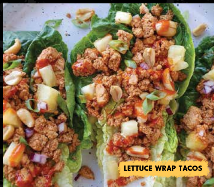
LETTUCE WRAP TACOS