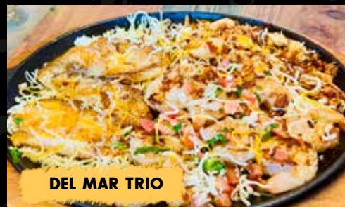
DEL MAR TRIO