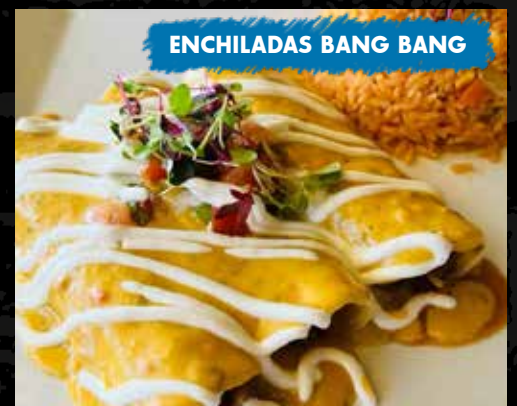
ENCHILADAS BANG BANG