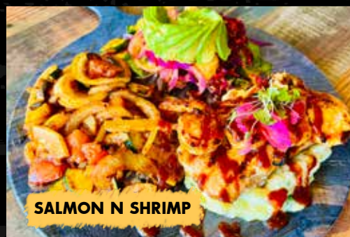
SALMON N SHRIMP