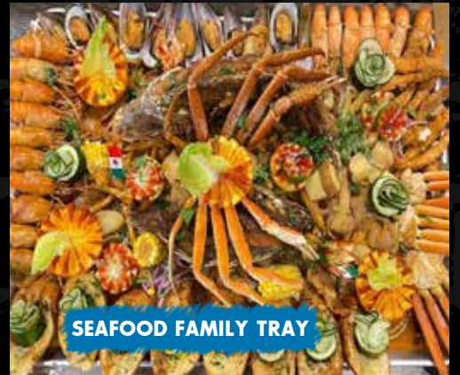
SEAFOOD FAMILY TRAY