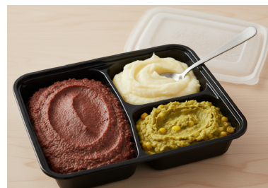
Sample pureed plate of stewed beef, potato, and vegetables

At Meals 4 All VI, we understand that everyone's dietary needs are unique. That's why we prepare customized meals to support your health and comfort — without sacrificing flavor! Whether you're vegetarian , require soft or pureed meals , or need a low-potassium (Low K) option, our team ensures each meal is both nutritious and satisfying.