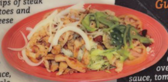
Chicken Tossed Salad

A crisp tortilla filled with beef or chicken, topped with lettuce, cheese, sour cream, guacamole and tomatoes 9.99