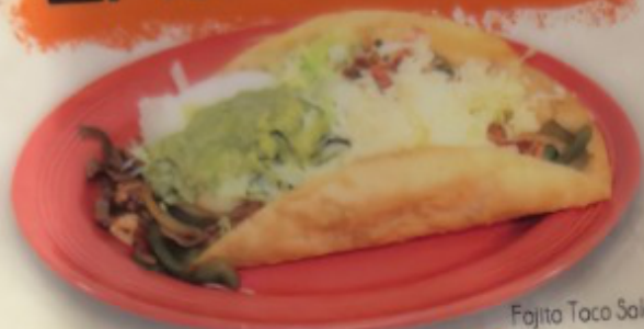
Fajita Taco Salad