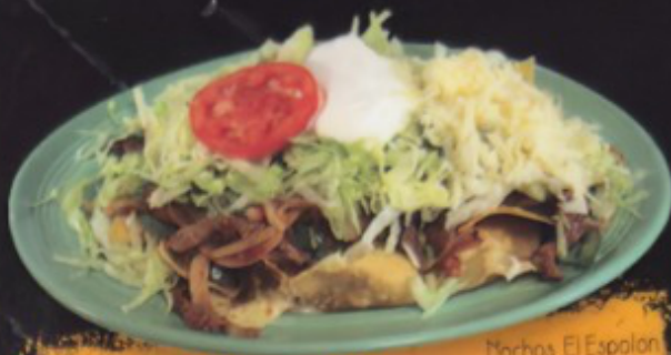
Nachos El Espolon