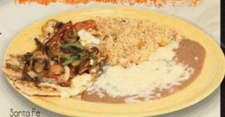
Santa Fe Chicken

Grilled chicken and mango with lettuce, tomatoes, onions, green peppers and cheese 11.15