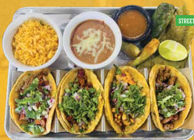
STREET TACOS (4)