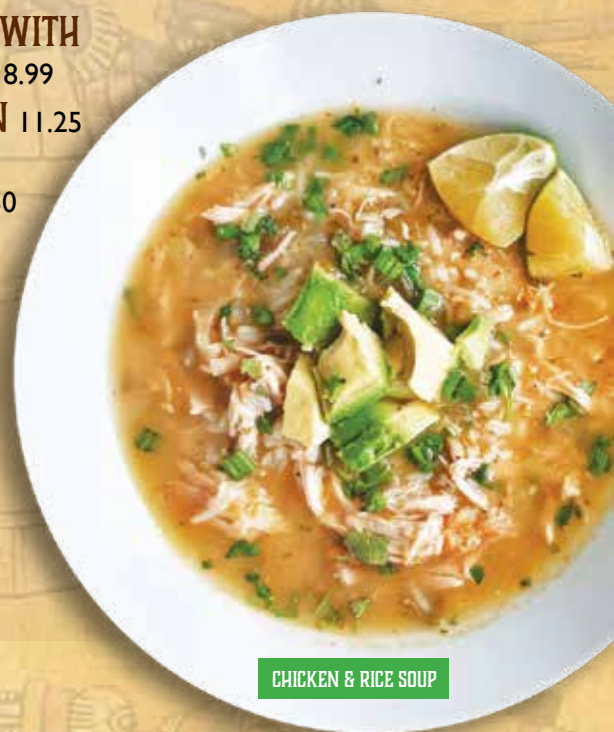
CHICKEN & RICE SOUP