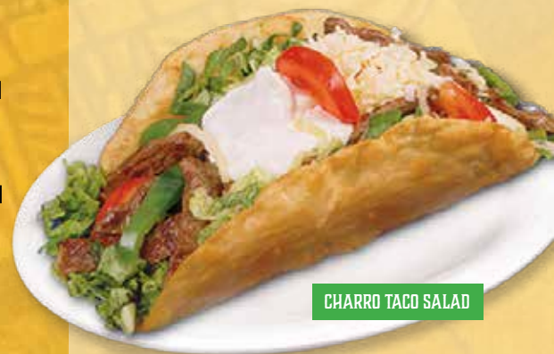
CHARRO TACO SALAD

Notice: Consuming raw or undercooked meats, poultry, seafood, shellfish, or eggs may increase your risk of foodborne illness.