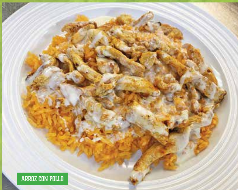
ARROZ CON POLLO