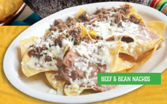
BEEF & BEAN NACHOS