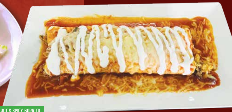
HOT & SPICY BURRITO