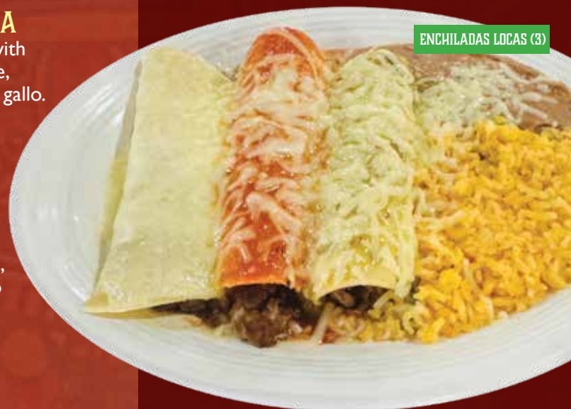
ENCHILADAS LOCAS (3)

Filled with chicken or steak: one topped with red sauce, one with green sauce and one with cheese sauce 15.99