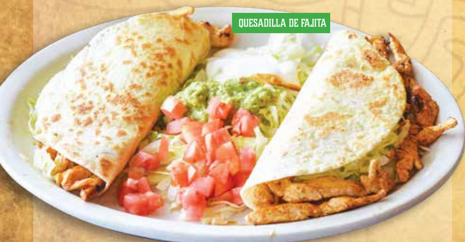
QUESADILLA DE FAJITA