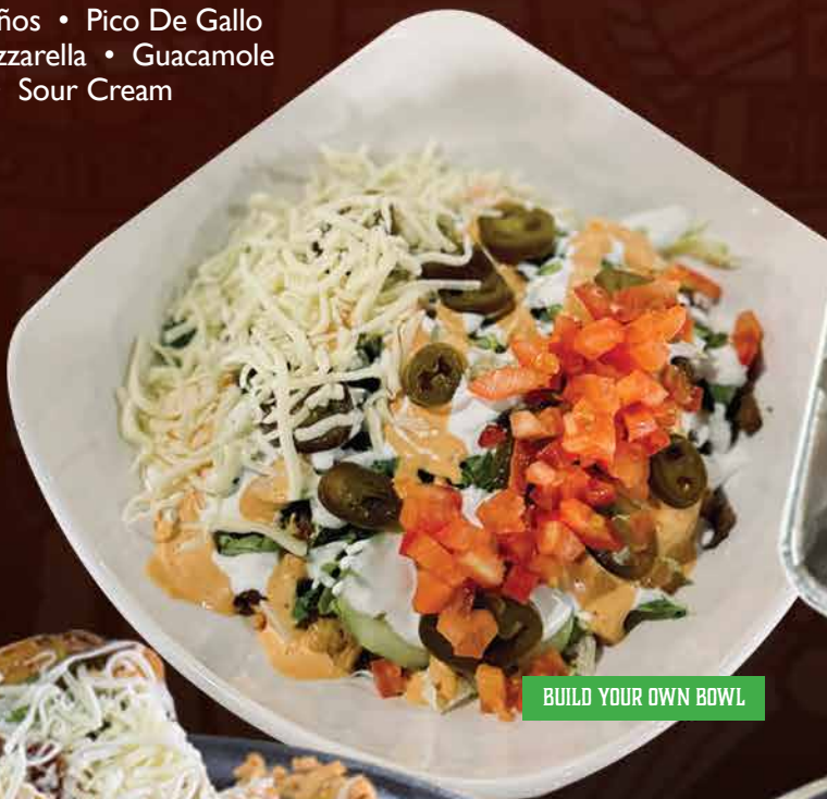
BUILD YOUR OWN BOWL