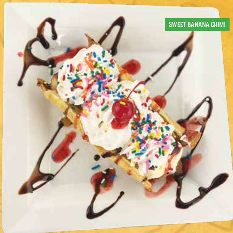
SWEET BANANA CHIMI

CHICKEN TENDERS, RICE & BEANS OR FRENCH FRIES 6.50