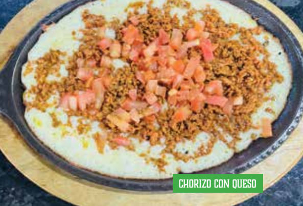
CHORIZO CON QUESO