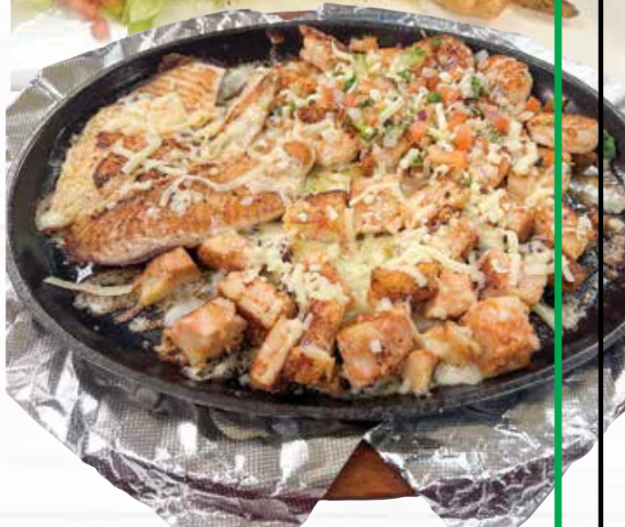
DEL MAR TRÍO