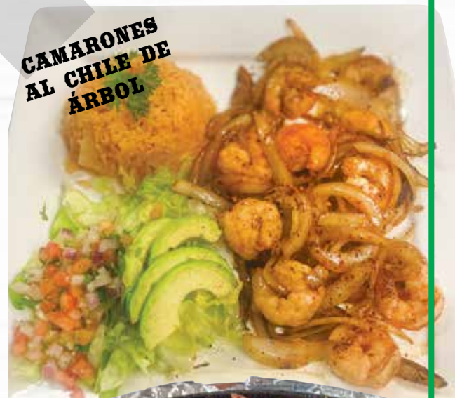
CAMARONES AL CHILE DE ÁRBOL