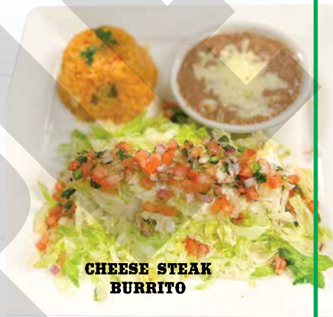
CHEESE STEAK BURRITO