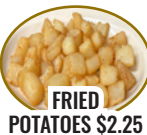
FRIED POTATOES $2.25