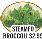
STEAMED BROCCOLI $2.99