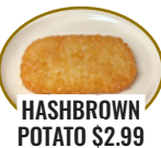
HASHBROWN POTATO $2.99