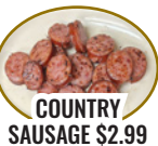
COUNTRY SAUSAGE $2.99