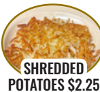
SHREDDED POTATOES $2.25