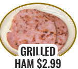
GRILLED HAM $2.99