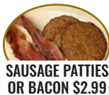
SAUSAGE PATTIES OR BACON $2.99

PLATES ARE SERVED WITH BEANS, POTATOES & (2) TORTILLAS