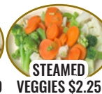
STEAMED VEGGIES $2.25