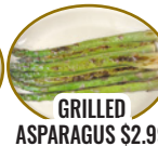
GRILLED ASPARAGUS $2.99