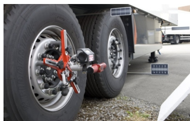
Upgrade Kit for trailer and semi-trailer