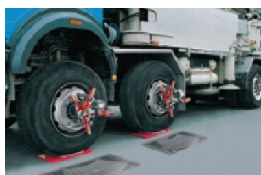
Upgrade Kit for vehicles with multiple steering axles