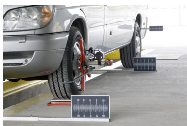
Upgrade Kit for cars and light trucks