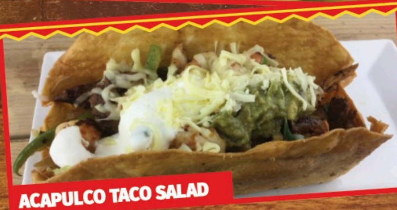
ACAPULCO TACO SALAD