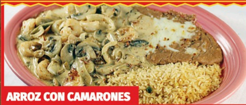
ARROZ CON CAMARONES