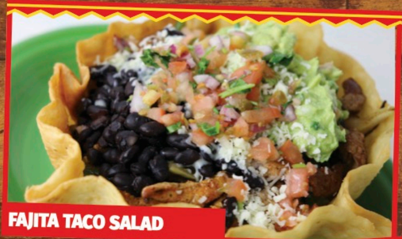
FAJITA TACO SALAD