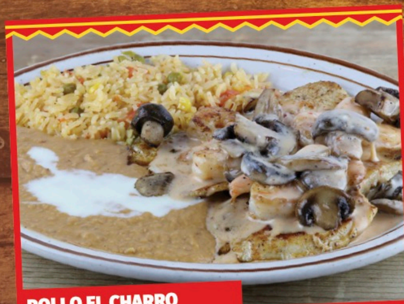
POLLO EL CHARRO

Onions and mushrooms over grilled chicken topped with chipotle cheese sauce. Served with rice, beans and tortillas. 13.99