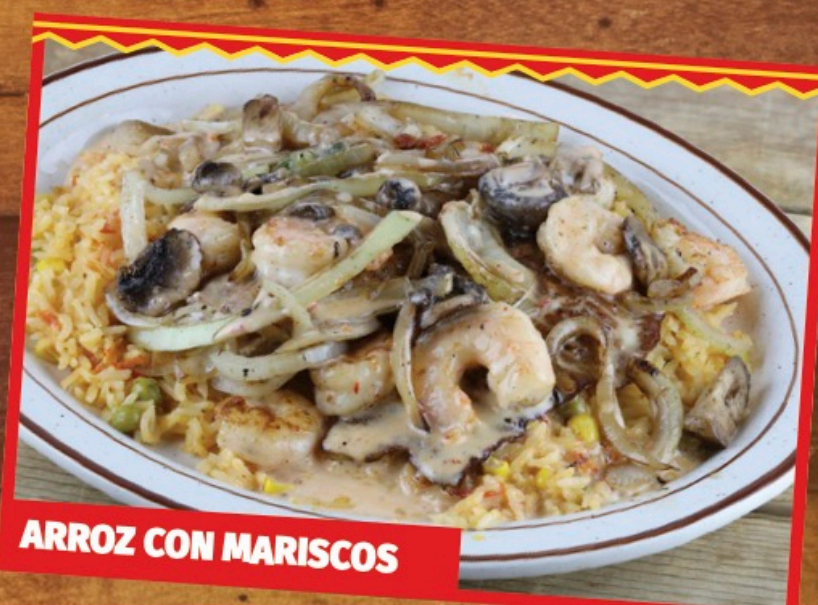
ARROZ CON MARISCOS