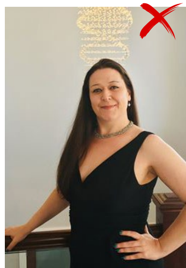
Bland background and distraction above head.