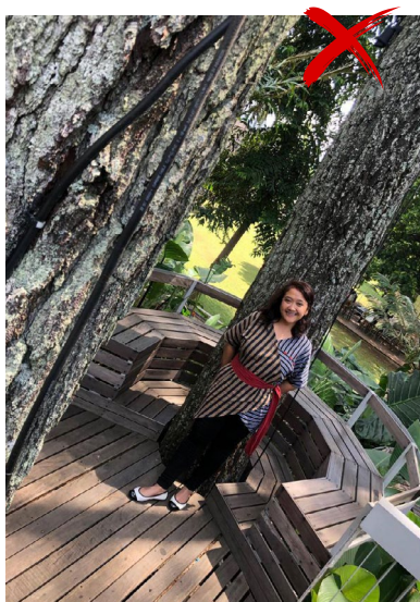
Tilted camera angle. No far away shots.