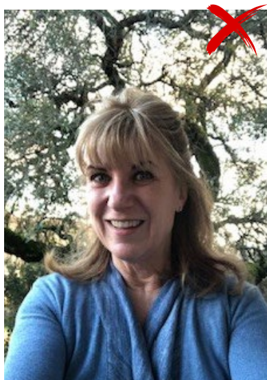
No selfies. Need to see arms and hands.