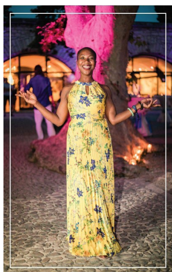
Photo hint for outdoor shots: Avoid squinting, make sure that the sun is not in your eyes. Watch out for background holiday items... SAY NO TO halloween pumpkins and Christmas trees. Also BE BRAND AWARE, no logos of any kind should be in your portrait, that includes logos on clothing or in the background.

Let the readers know just who you are by showing your personality in your photo. You can show your personality with the clothes you wear, backgrounds, or even props, just remember to keep it simple and subtle.