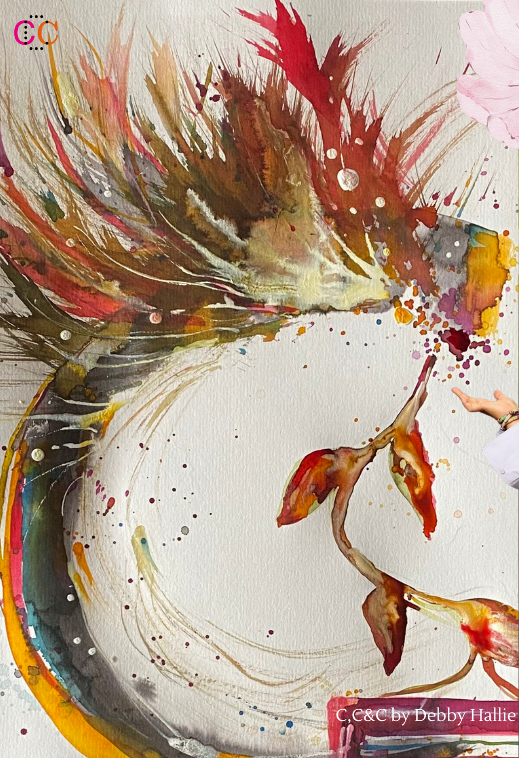
C.C&C