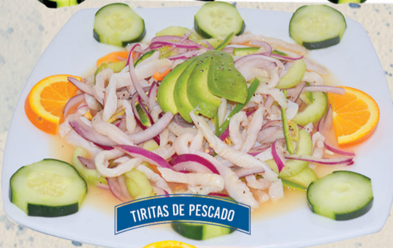
TIRITAS DE PESCADO