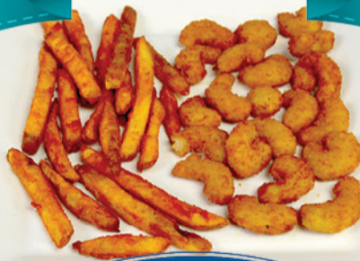
POPCORN SHRIMP $7.99

Chicken fingers with your choice of fries or rice.