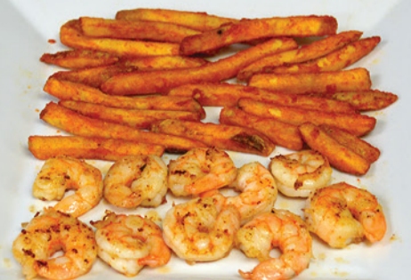
KIDS CAMARONES A LA PLANCHA $7.99

Grilled shrimps with your choice of fries or rice.