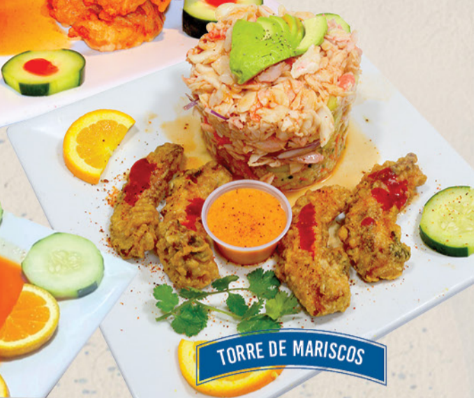
TORRE DE MARISCOS