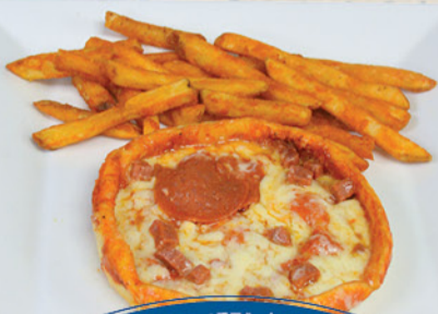
KIDS PIZZA $7.99

Grilled fish with your choice of rice or beans.