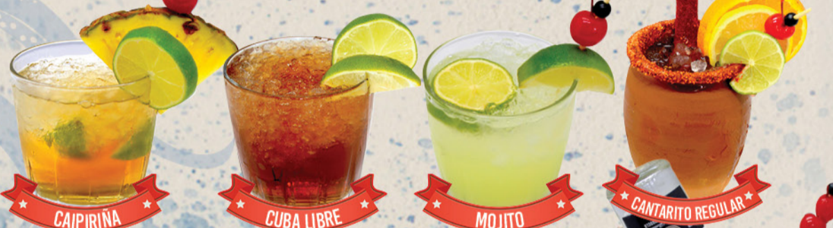
★ CAIPIRIÑA ★ ★ CUBA LIBRE ★ ★ MOJITO ★ ★ CANTARITO REGULAR ★