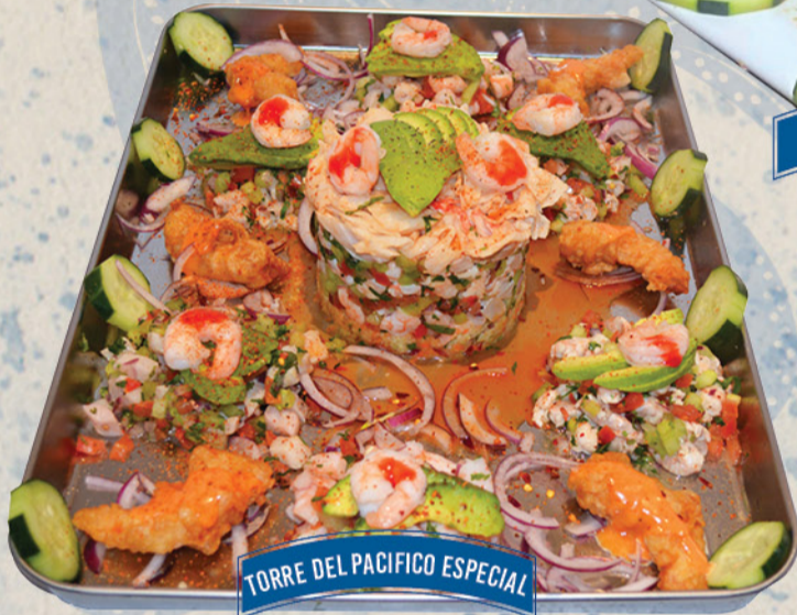
TORRE DEL PACIFICO ESPECIAL