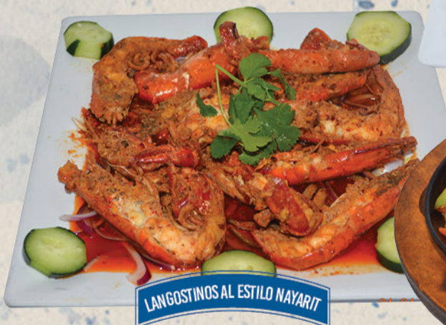
LANGOSTINOS AL ESTILO NAYARIT