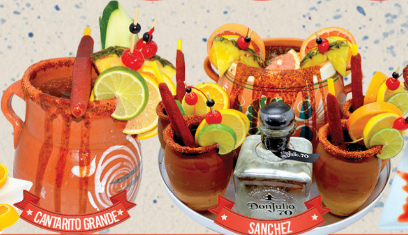
★ CANTARITO GRANDE ★