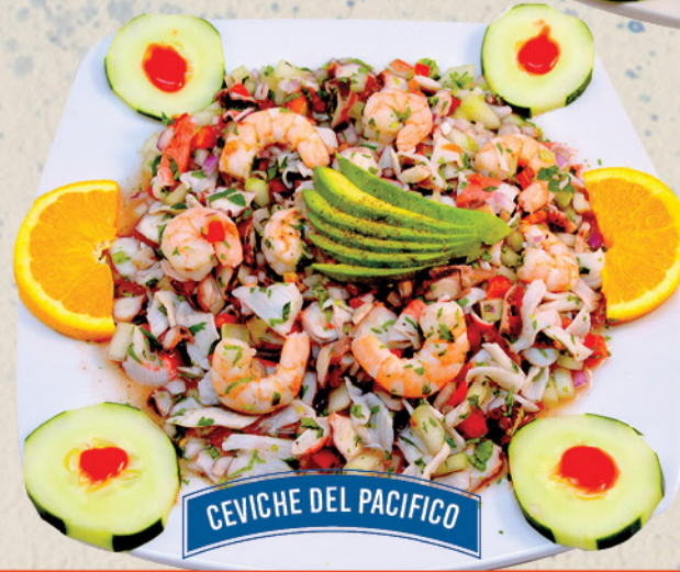
CEVICHE DEL PACIFICO