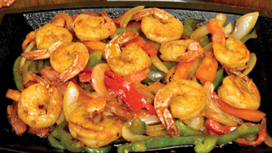
FAJITA DE CAMARON