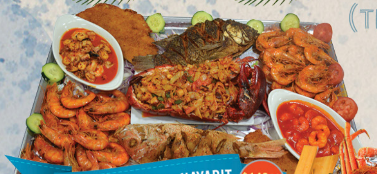
CHAROLA PACIFICO NAYARIT $149 99