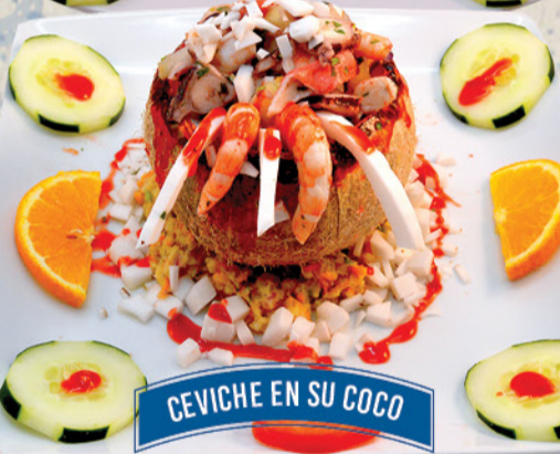
CEVICHE EN SU COCO