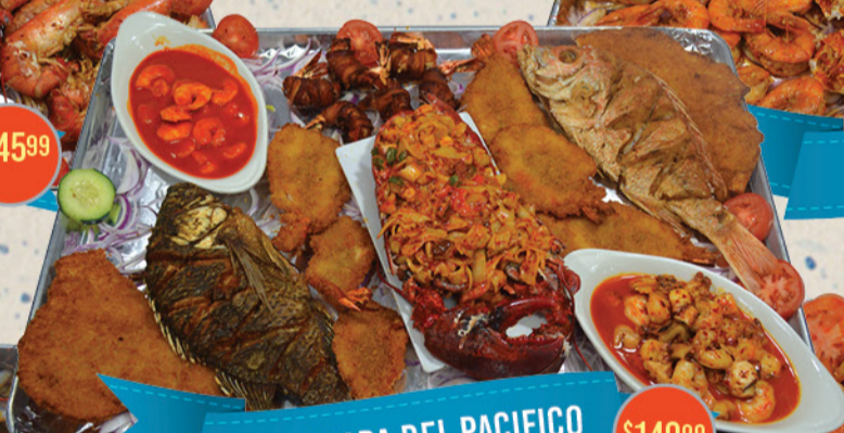
MARISCADA DEL PACIFICO $149 99