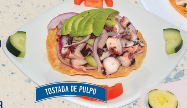
TOSTADA DE PULPO