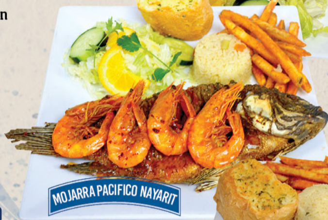
MOJARRA PACIFICO NAYARIT