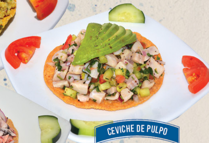
CEVICHE DE PULPO