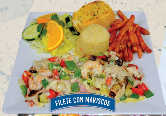
FILETE CON MARISCOS