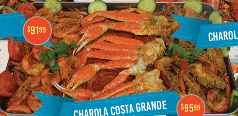
CHAROLA COSTA GRANDE $95 99