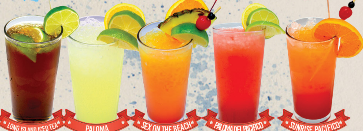
★ LONG ISLAND ICED TEA ★ ★ PALOMA ★ ★ SEX ON THE BEACH ★ ★ PALOMA DEL PACIFICO ★ ★ SUNRISE PACIFICO ★