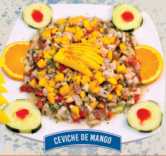
CEVICHE DE MANGO

*NOTICE: CONSUMING RAW OR UNDER COOKED MEATS, POULTRY, SHELLFISH OR EGGS MAY INCREASE YOUR RISK OF FOOD BORNE ILLNESS, ESPECIALLY IF YOU HAVE CERTAIN MEDICAL CONDITIONS. *PLEASE ALERT YOUR SERVER OF ANY FOOD ALLERGIES PRIOR TO ORDERING. WE ARE NOT RESPONSIBLE FOR AN INDIVIDUAL'S ALLERGIC REACTION TO OUR FOOD OR INGREDIENTS USED IN FOOD ITEMS.