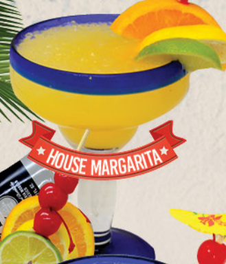
★ HOUSE MARGARITA ★