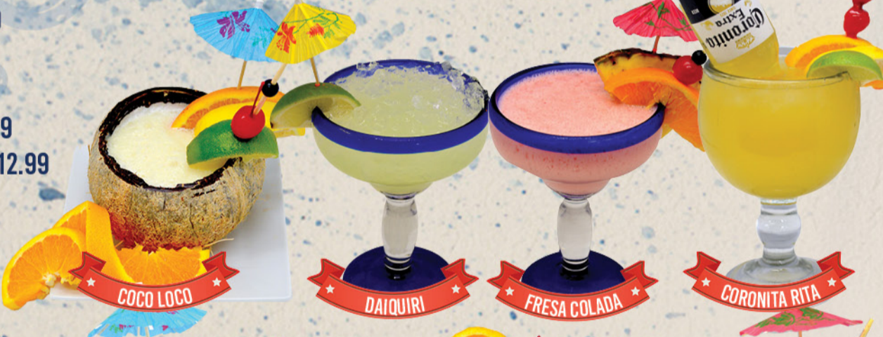
★ COCO LOCO ★ ★ DAIQUIRI ★ ★ FRESA COLADA ★ ★ CORONITA RITA ★