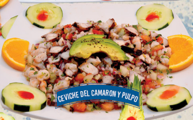
CEVICHE DEL CAMARON Y PULPO