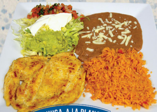
PECHUGA A LA PLANCHA

TACO SALAD DE CAMARON. $12.99 Shrimp taco salad.