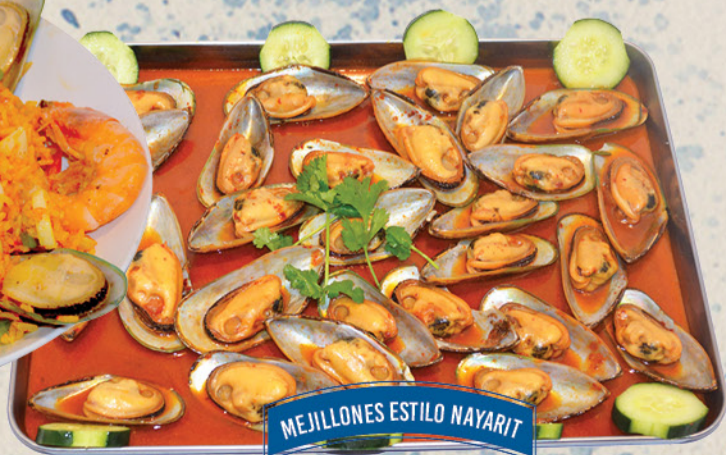
MEJILLONES ESTILO NAYARIT

*NOTICE: CONSUMING RAW OR UNDER COOKED MEATS, POULTRY, SHELLFISH OR EGGS MAY INCREASE YOUR RISK OF FOOD BORNE ILLNESS, ESPECIALLY IF YOU HAVE CERTAIN MEDICAL CONDITIONS. *PLEASE ALERT YOUR SERVER OF ANY FOOD ALLERGIES PRIOR TO ORDERING. WE ARE NOT RESPONSIBLE FOR AN INDIVIDUAL'S ALLERGIC REACTION TO OUR FOOD OR INGREDIENTS USED IN FOOD ITEMS.