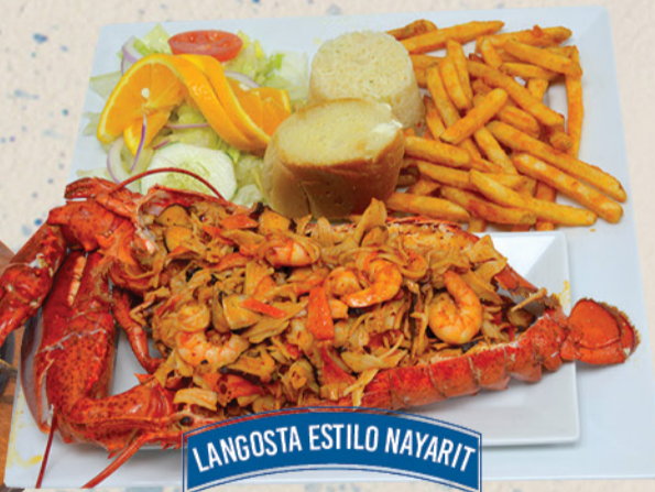
LANGOSTA ESTILO NAYARIT