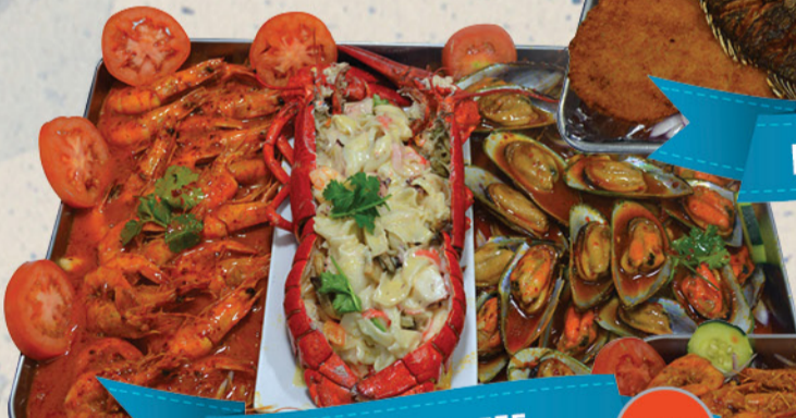
CHAROLA EL JEFE $91 99