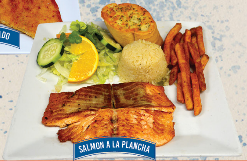
SALMON A LA PLANCHA