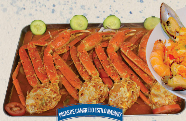
PATAS DE CANGREJO ESTILO NAYARIT