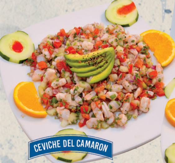
CEVICHE DEL CAMARON