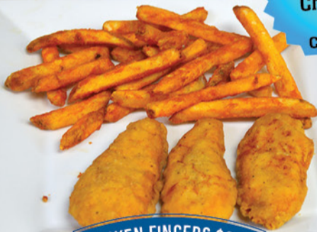
CHICKEN FINGERS $6.99

Chicken fingers with your choice of fries or rice.