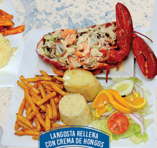
LANGOSTA RELLENA CON CREMA DE HONGOS