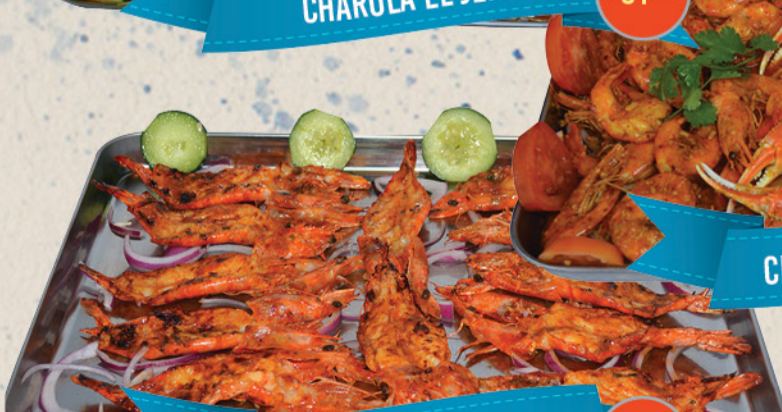
CHAROLA DE CAMARONES ZARANDEADOS $45 99