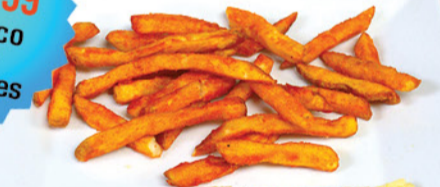
KIDS CHEESE QUESADILLA $6.99

Popcorn shrimp with your choice of fries or rice.