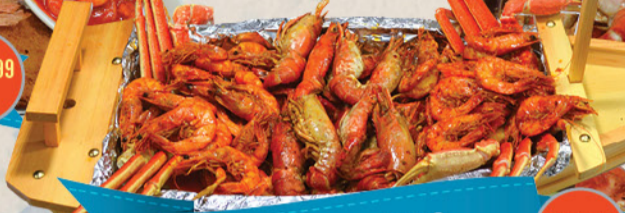
BARCO PACIFICO $159 99