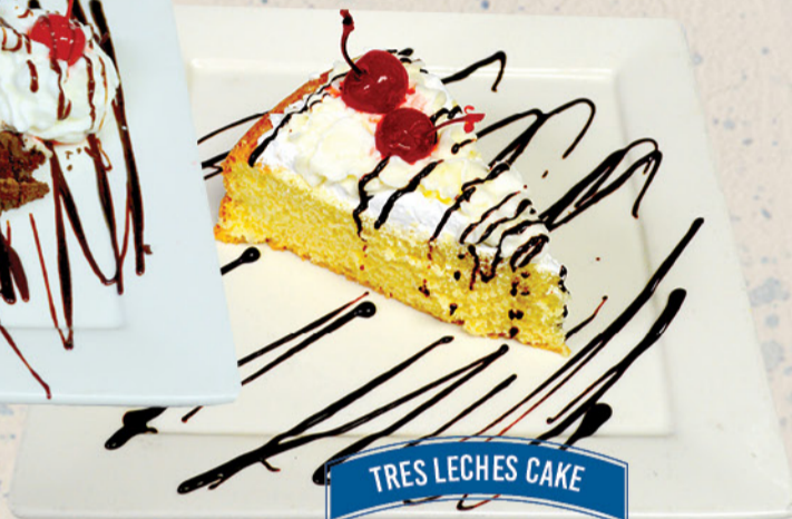
TRES LECHES CAKE