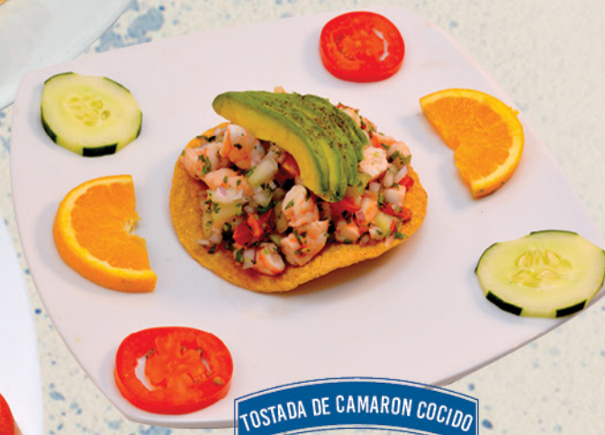
TOSTADA DE CAMARON COCIDO