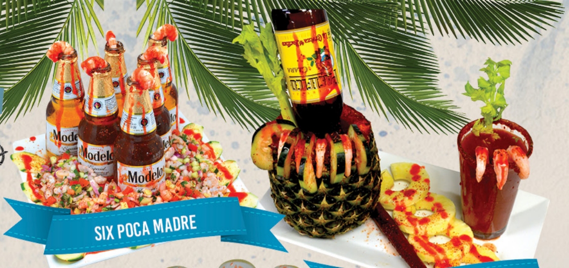
SIX POCA MADRE