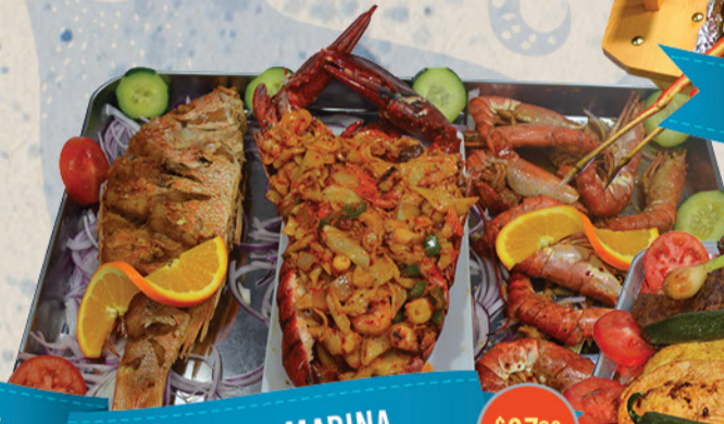
CHAROLA MARINA $97 99