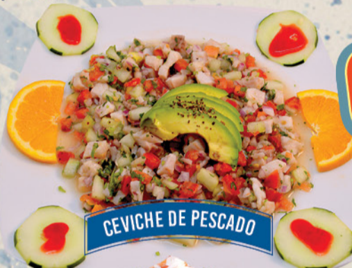
CEVICHE DE PESCADO