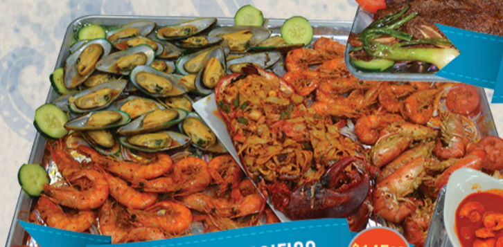
CHAROLA DEL PACIFICO $145 99