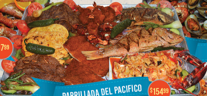
PARRILLADA DEL PACIFICO $154 99