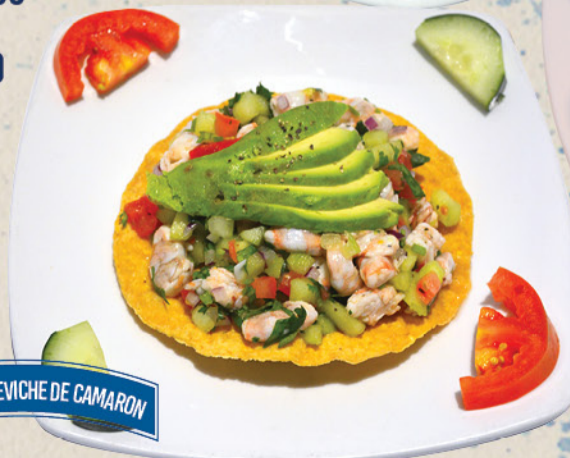
TOSTADA DE CEVICHE DE CAMARON

*NOTICE: CONSUMING RAW OR UNDER COOKED MEATS, POULTRY, SHELLFISH OR EGGS MAY INCREASE YOUR RISK OF FOOD BORNE ILLNESS, ESPECIALLY IF YOU HAVE CERTAIN MEDICAL CONDITIONS. *PLEASE ALERT YOUR SERVER OF ANY FOOD ALLERGIES PRIOR TO ORDERING. WE ARE NOT RESPONSIBLE FOR AN INDIVIDUAL'S ALLERGIC REACTION TO OUR FOOD OR INGREDIENTS USED IN FOOD ITEMS.