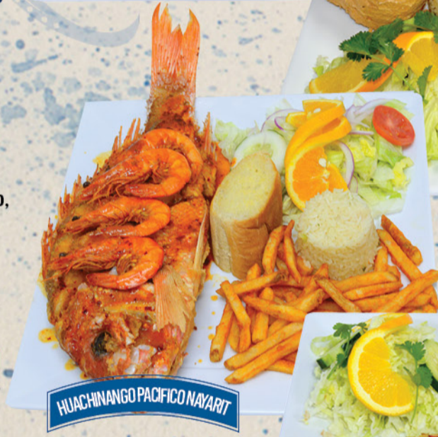
HUACHINANGO PACIFICO NAYARIT