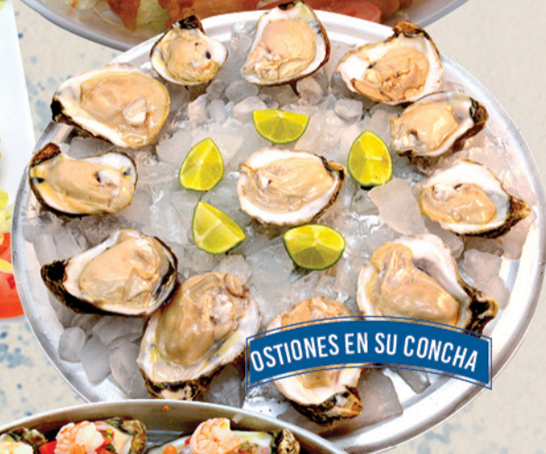
OSTIONES EN SU CONCHA