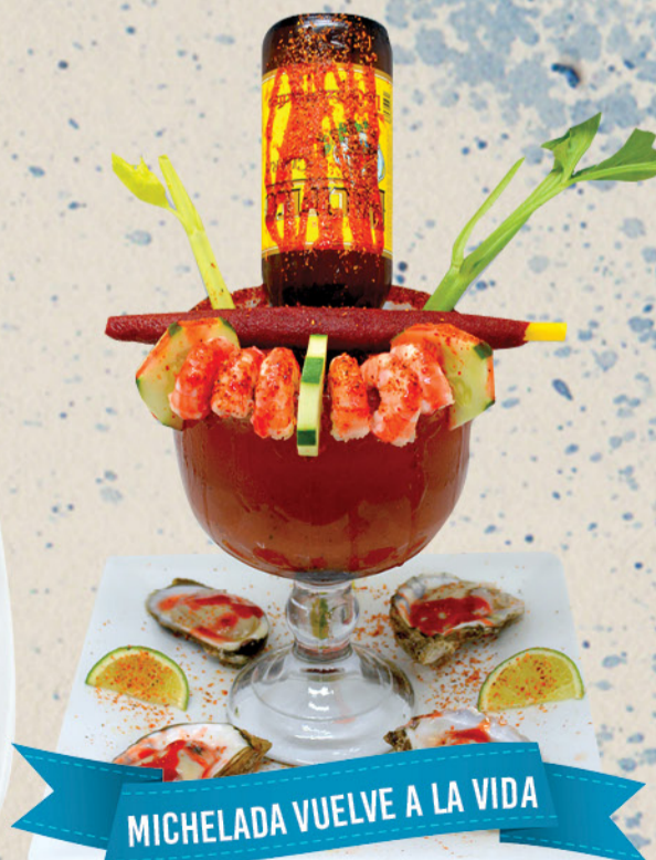
MICHELADA VUELVE A LA VIDA