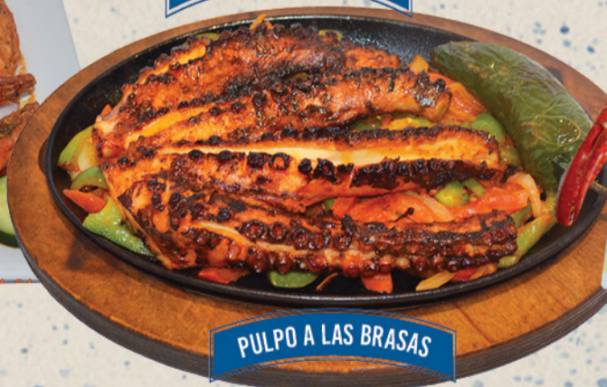
PULPO A LAS BRASAS