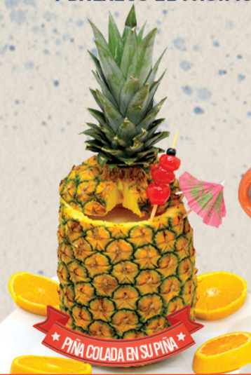
★ PINA COLADA EN SU PINA ★