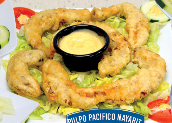
PULPO PACIFICO NAYARIT