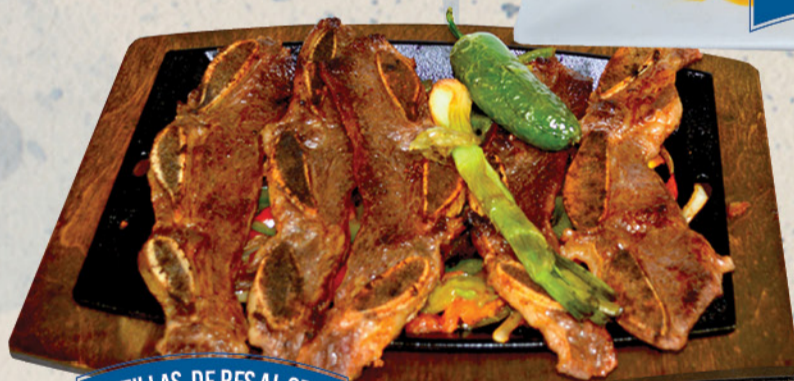
COSTILLAS DE RES AL GRILL