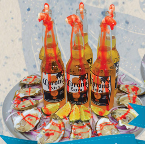
SIX VUELVE A LA VIDA