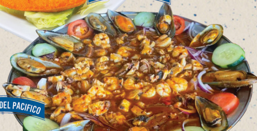
CHAPUZON DEL PACIFICO