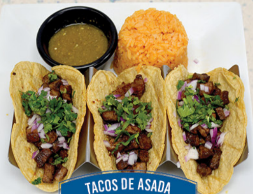
TACOS DE ASADA