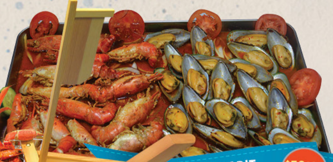
CHAROLA NAYARIT $59 99