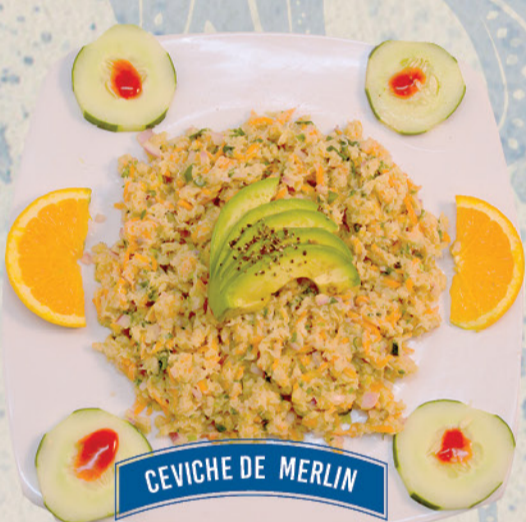
CEVICHE DE MERLIN

*CEVICHE DE PULPO. $18.99 Octopus Ceviche.