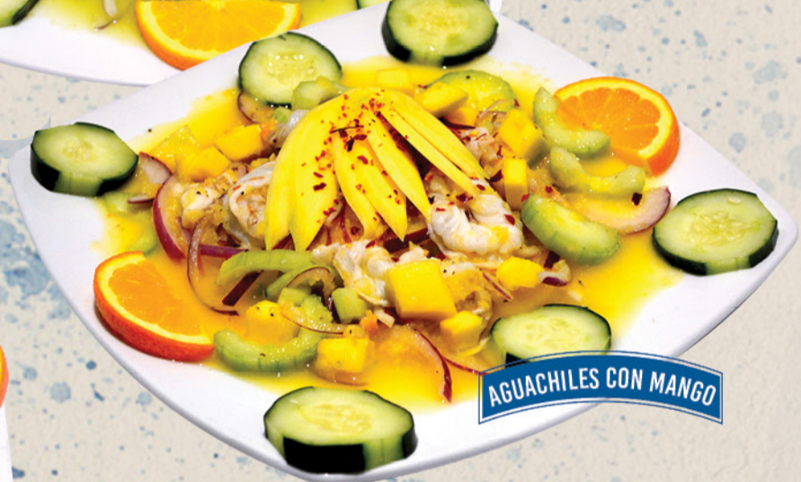
AGUACHILES CON MANGO