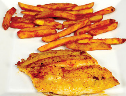
KIDS FILETE A LA PLANCHA $7.99

CHICKEN. $7.99 Cheese or chicken quesadilla with your choice of fries or rice.