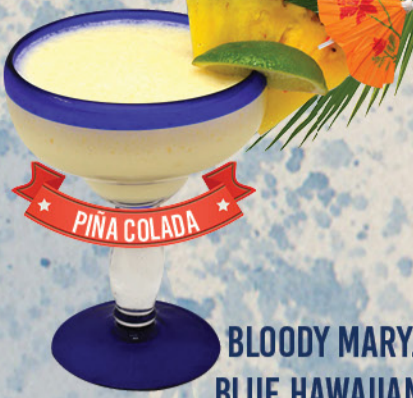
★ PINA COLADA ★