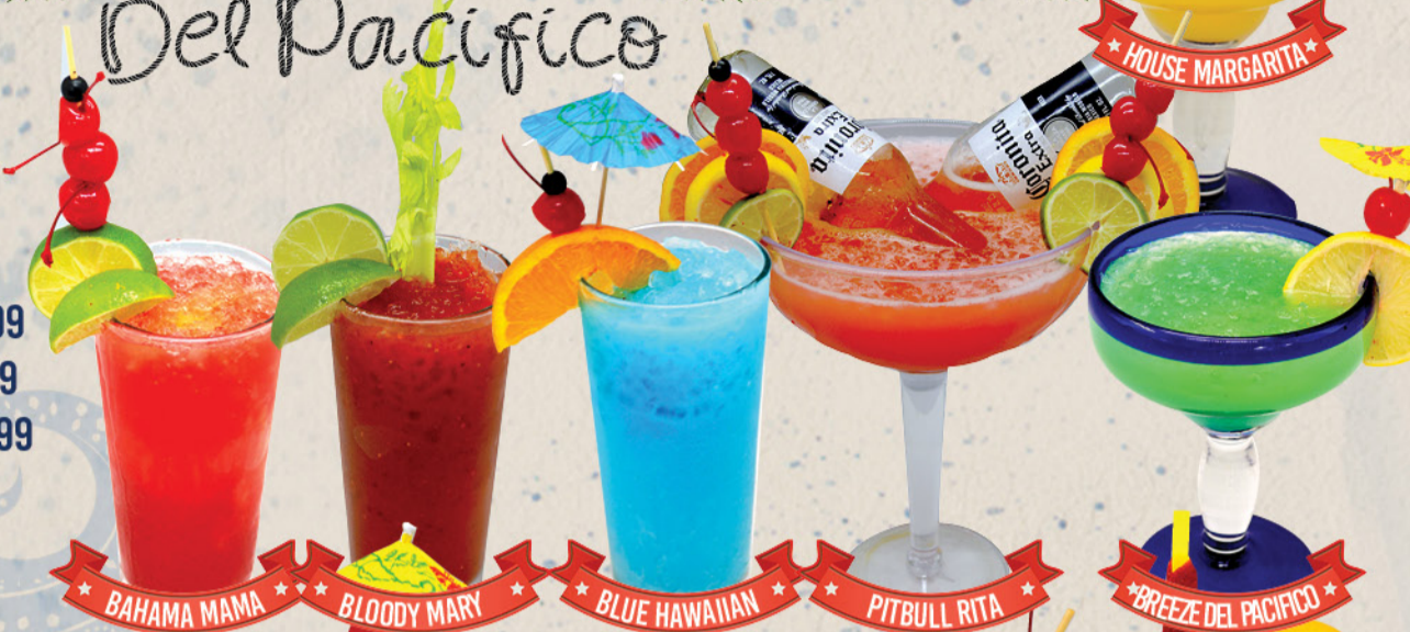
★ BAHAMA MAMA ★ ★ BLOODY MARY ★ ★ BLUE HAWAIIAN ★ ★ PITBULL RITA ★ ★ BREEZE DEL PACIFICO ★