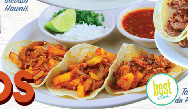
Tacos de Pastor