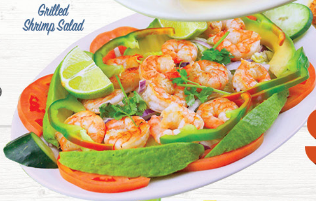
Grilled Shrimp Salad

Lettuce, tomato, onion, bell pepper, shredded cheese, topped with seasoned grilled chicken. 10.99