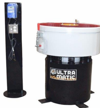
VB3.5 with Variable Speed Drive, On Off Timer Switch with corded plug Included with Machine