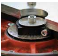
Adjustable Flywheels and Weights

DIRECT DRIVE SERIES • features a Heavy Duty Vibratory Motor with easily adjustable weights. This unique design feature eliminates belts and pulleys and supplies 100 % power to the Tub. Requires 50% less HP resulting in huge electrical operation cost savings.