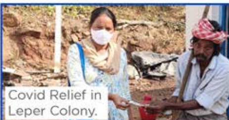
Covid Relief in Leper Colony.