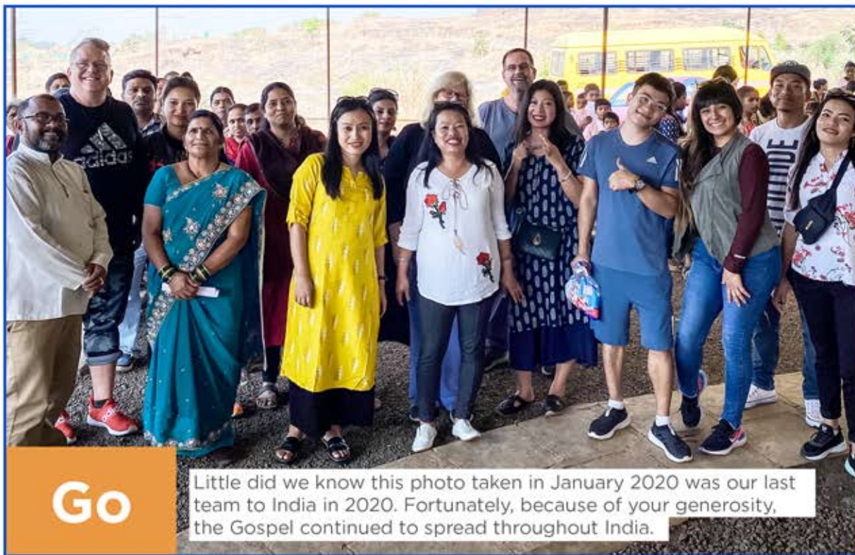
Little did we know this photo taken in January 2020 was our last team to India in 2020. Fortunately, because of your generosity, the Gospel continued to spread throughout India.