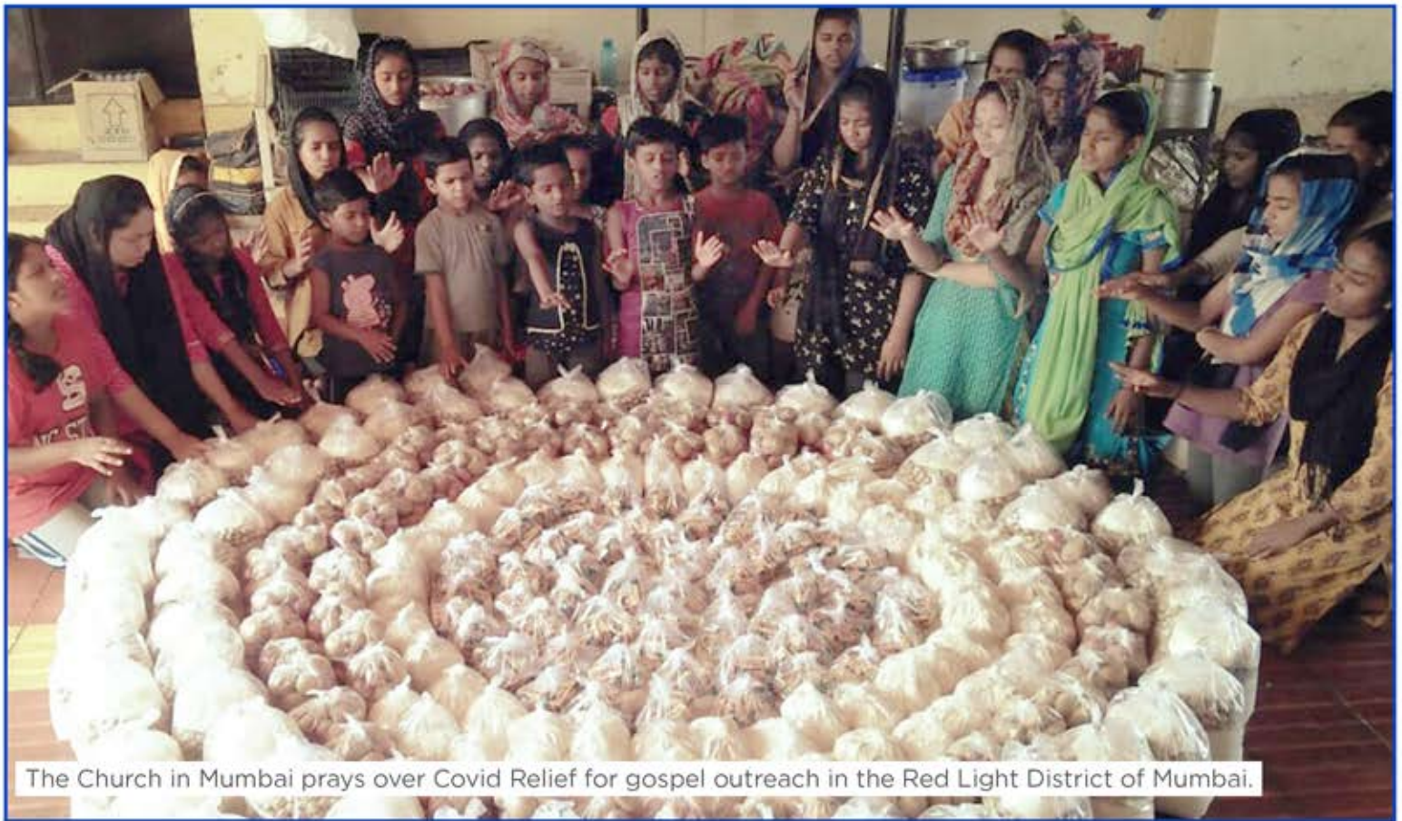
The Church in Mumbai prays over Covid Relief for gospel outreach in the Red Light District of Mumbai.