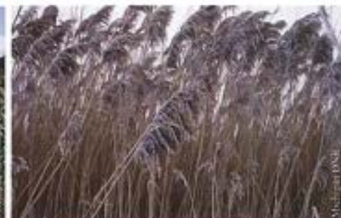
Phragmites stands during winter.