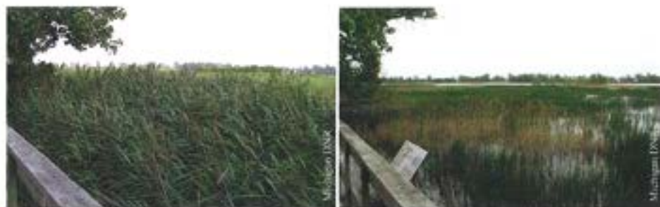
Photo on the left: A treatment site in Sterling State Park with a dense stand of phragmites prior to any treatment. Photo on the right: A treatment site shown in the spring after a fall herbicide treatment using a glyphosate/imazapyr combination followed by a winter

No biological control methods for phragmites are currently available. However, researchers at Cornell University are studying several insects native to Europe that are known to attack phragmites as possible biological controls. For more information, visit http://invasiveplants.net .