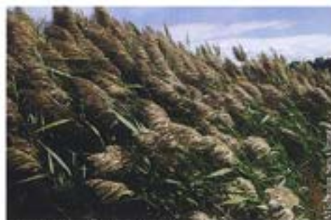
Phragmites stands during summer.

Although it is uncommon, native phragmites can be found in some areas. Before attempting to control phragmites, it is important to identify the native phragmites versus the non-native, invasive variety. Additional information on how to identify native versus non-native phragmites can be found at www.invasiveplants.net/phragmites/phrag/morph.htm .