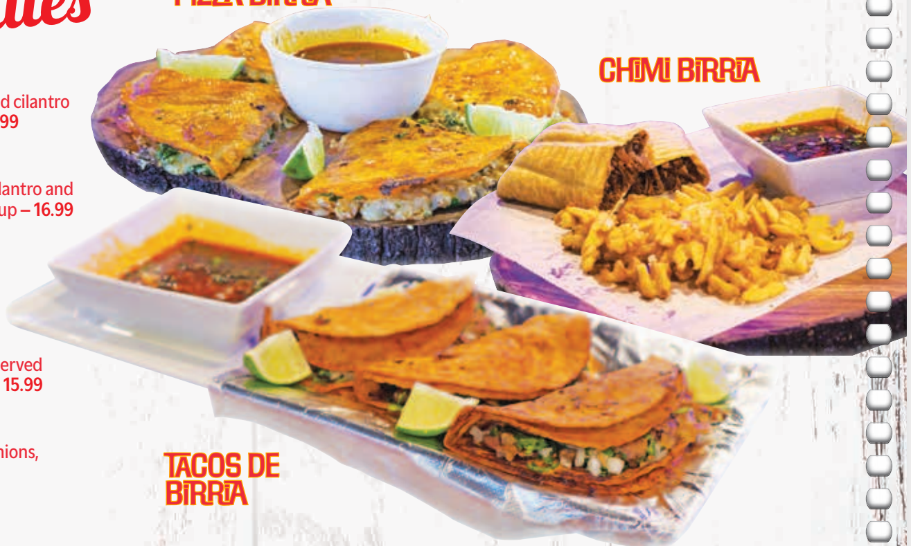
TACOS DE BIRRIA

Consuming raw or undercooked meats, poultry, seafood, shellfish or eggs may increase your risk of foodborne illness, especially if you have certain medical conditions. Chicken may contain small bones. Mexican food is good only when prepared and served hot. Please allow us ample time to prepare your food right. Thank you.