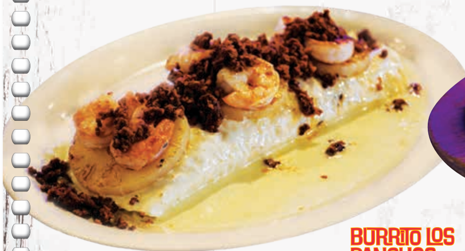
BURRITO LOS PANCHOS