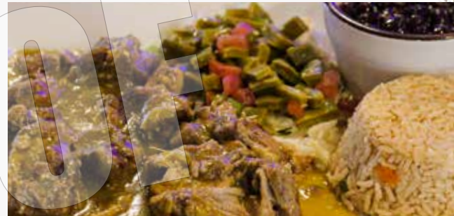
CARNITAS A LA MEXICANA