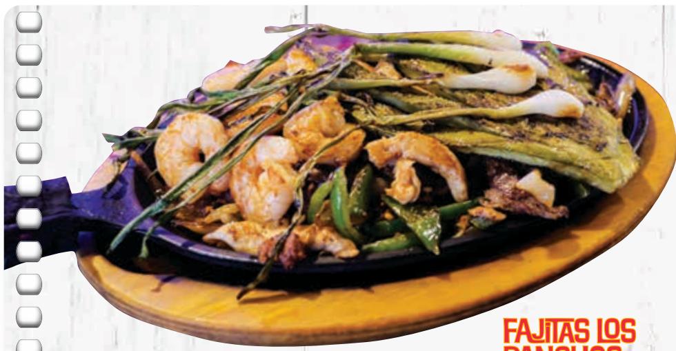
FAJITAS LOS PANCHOS