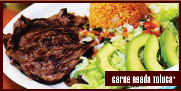
carne asada toluca*