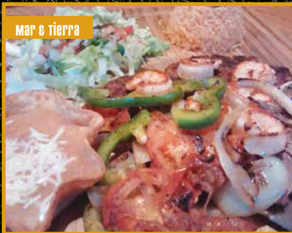
Mar & Tierra