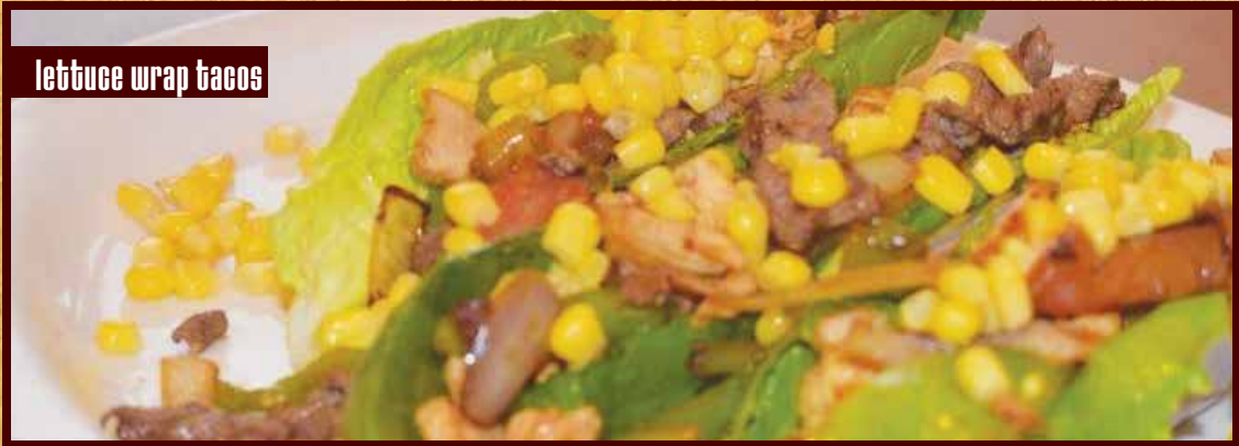
lettuce wrap tacos