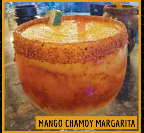
MANGO CHAMOY MARGARITA