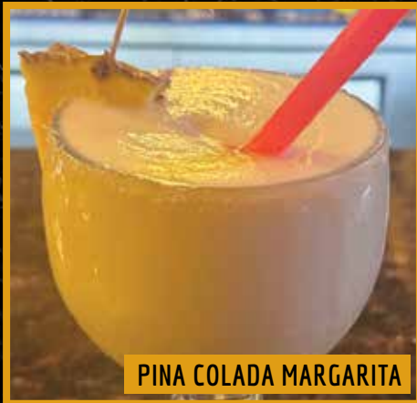
PINA COLADA MARGARITA