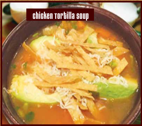
chicken tortilla soup