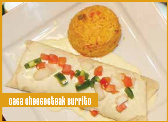
casa cheesesteak burrito