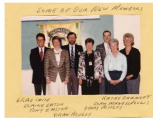
Inducting new members to the club.