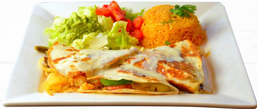
EL PATRON SPECIAL

WE COOKED OUR FOOD DAILY WE USE VEGETABLE OIL YOU CAN SUBSTITUTE RED SAUCE FOR CHEESE SAUCE ADD 2.99 EXTRA