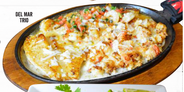
DEL MAR TRIO

Shrimp, lobster and tilapia with steamed vegetables, topped with cheese sauce and slices of tomatoes 27.99