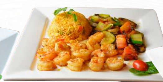
CAMARON AL MOJO DE AJA