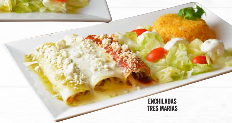
ENCHILADAS TRES MARIAS