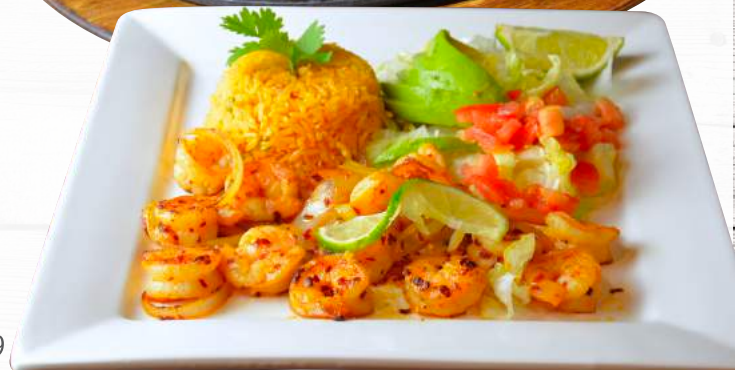
CAMARON AL CHILE DE ARBOL

*Notice: Foods cooked to order, consuming raw or undercooked meats, poultry, seafood, shellfish or eggs may increase your risk for food borne illnesses, especially if you have certain medical conditions.