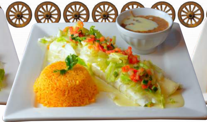
CHEESE STEAK BURRITO