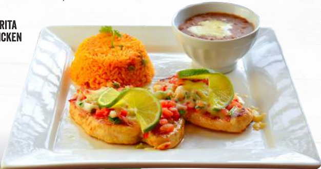
MARGARITA LIME CHICKEN

Grilled steak, topped with grilled mushrooms, onions, zucchini, tomatoes and melted cheese. Served with rice, beans and flour tortillas 21.99