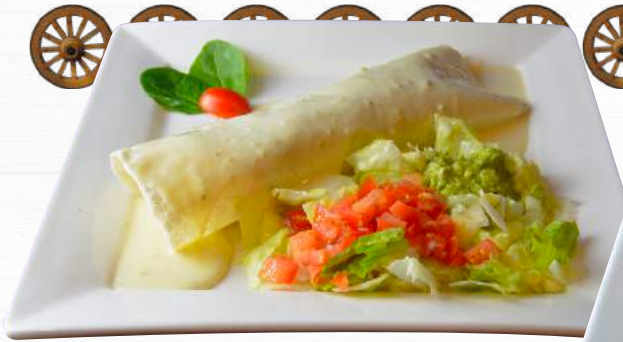
GRANDE BURRITO FAJITA