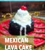
MEXICAN LAVA CAKE