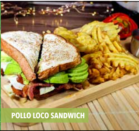
POLLO LOCO SANDWICH