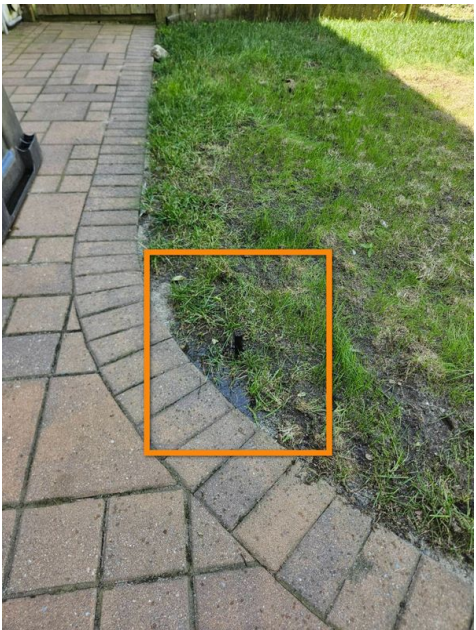
Zone 4 head - inoperable

Contact a qualified landscaping contractor