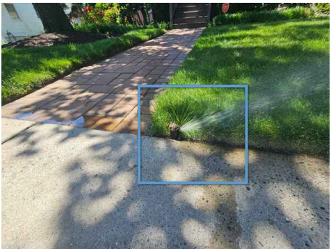
Zone 3 head needs adjustment

Contact a qualified landscaping contractor