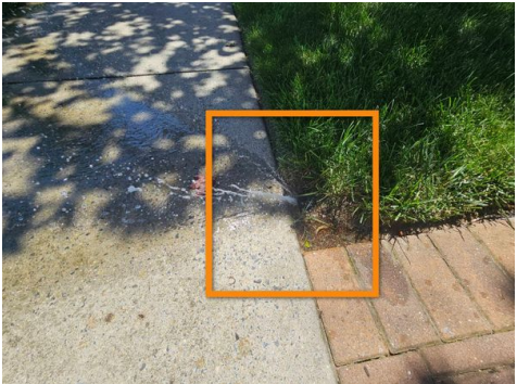
Zone 3 head needs adjustment

Contact a qualified landscaping contractor