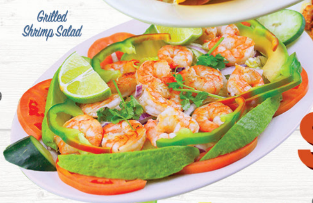
Grilled Shrimp Salad

Lettuce, tomato, onion, bell pepper, shredded cheese, topped with seasoned grilled chicken. 10.99