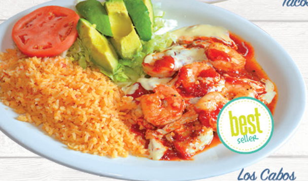
Los Cabos Special