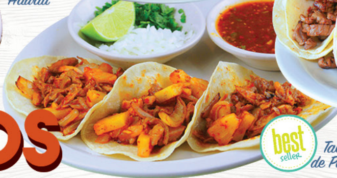
Tacos de Pastor