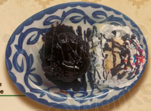
Chocolate Lava Cake