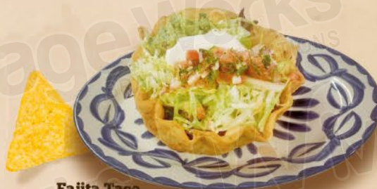
Fajita Taco Salad

A fried flour tortilla shaped like a bowl filled with: Grilled Chicken $14, Steak $15, or Shrimp $16, cooked with onions, tomatoes, mushrooms, bell peppers, and broccoli. Topped with cheese dip, lettuce, sour cream, and pico de gallo.