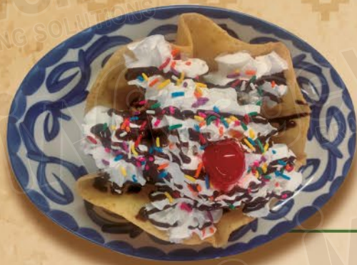
Fried Ice and Cream