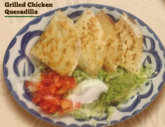
Grilled Chicken Quesadilla