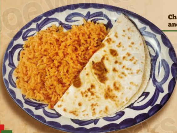
Cheese Quesadilla and Rice