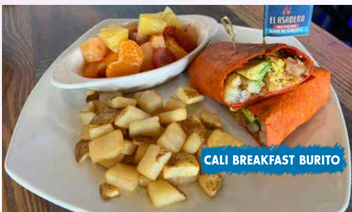
CALI BREAKFAST BURITO