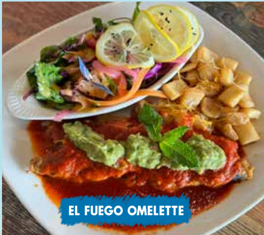
EL FUEGO OMELETTE