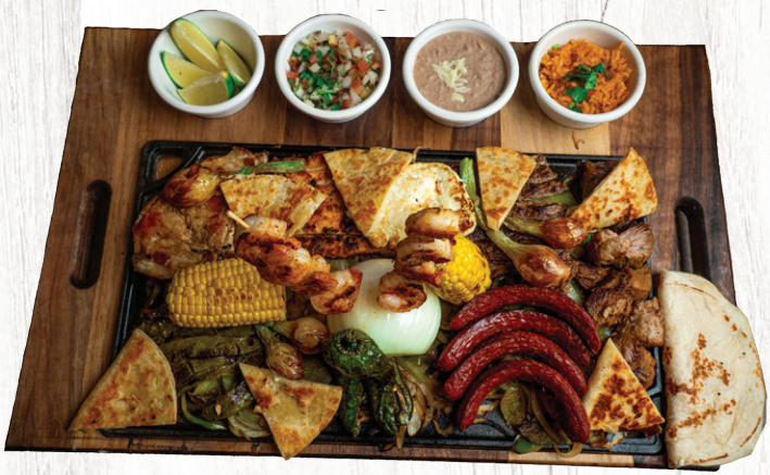
PARRILLADA DEL REY