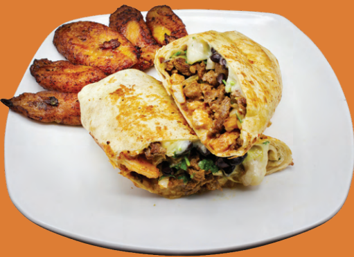
OLD TOWN BURRITO