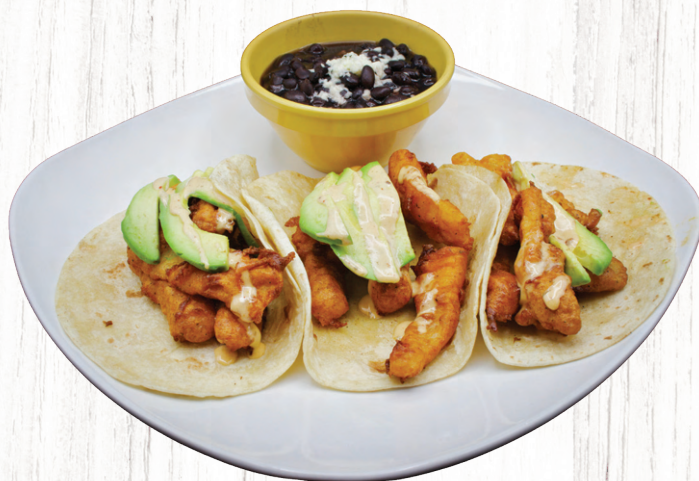
TACOS ESTILO BAJA

Three shredded chicken or ground beef enchiladas covered with cheese dip and grilled pineapple, rice, and house salad on the side served with southwest sauce