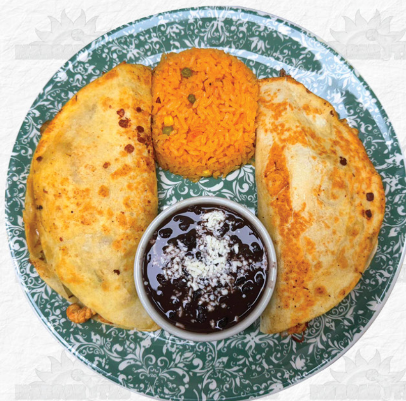
Quesadillas Super Fajita