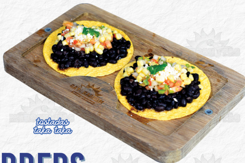
tostadas taka taka

12inch flour tortilla stuffed with spinach, lettuce, sour cream, guacamole, pico de gallo, rice, and beans topped with cheese dip. 15.99