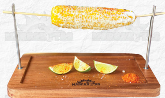
mexican street elote