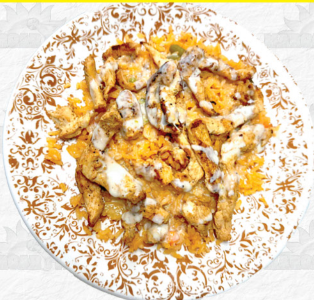
arroz con pollo

MEXICAN RICE, REFRIED BEANS, BLACK BEANS, CREMA SALAD, CALIFORNIA VEGGIES (MAY VARY BY SEASON), STEAM CORN, GUACAMOLE SALAD, SPRING MIX SALAD (SERVED WITH CHIPOTLE DRESSING)