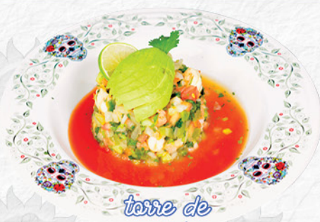
torre de ceviche