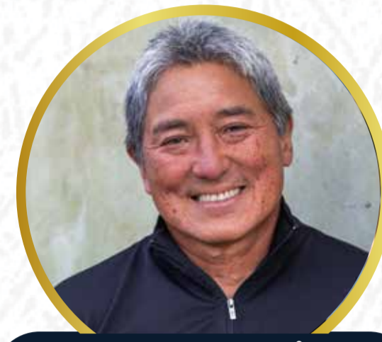
Guy Kawasaki Host of Remarkable People Podcast and Chief Evangelist of Apple & Canva