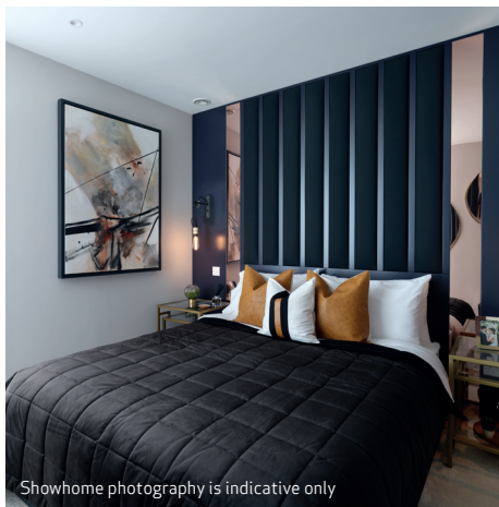
Showhome photography is indicative only