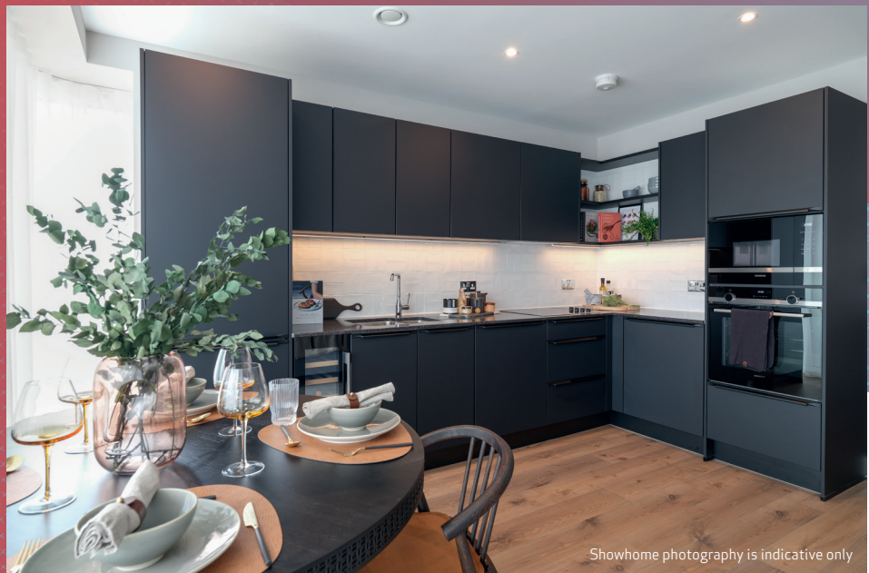
Showhome photography is indicative only

Many of the homes benefit from a spacious balcony and views over the beautiful gardens.