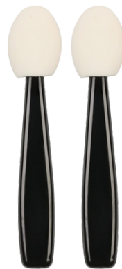
Typical eye-shadow applicators can easily be used if you are unable to get a Sofft tools set.