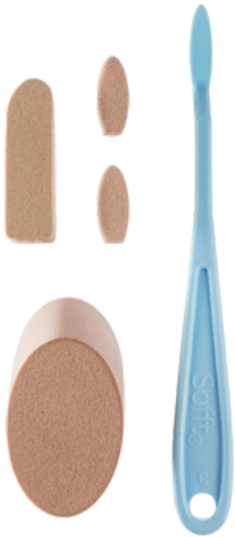
Sofft Tools set Can be purchased from Art stores and Amazon

Blenders and Sofft tools are used to create smooth transitions. If you don't have Sofft tools, makeup applicator sponges are useful.