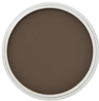
Burnt Sienna - Extra Dark