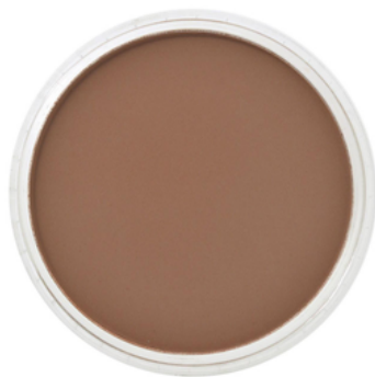
Burnt Sienna - Shade