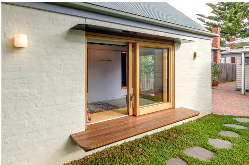
↑ Window seat inside, bench outside: creating connections to the garden.