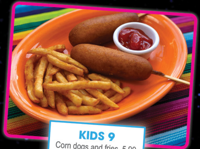
KIDS 9 Corn dogs and fries. 5.99