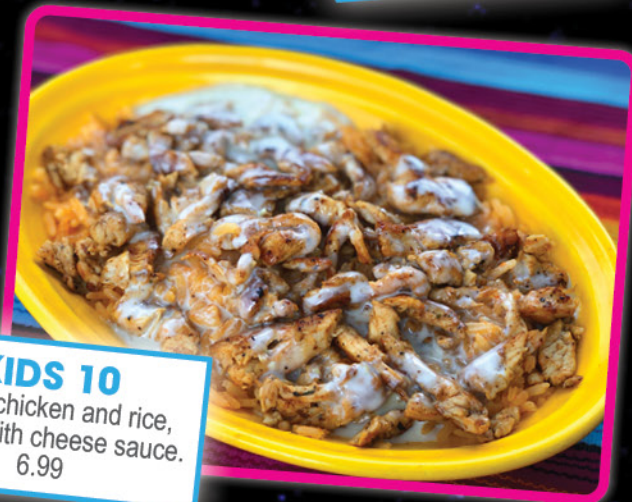
KIDS 10 Grilled chicken and rice, topped with cheese sauce. 6.99