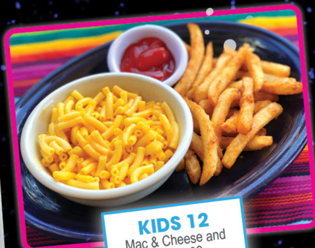
KIDS 12 Mac & Cheese and fries. 6.99