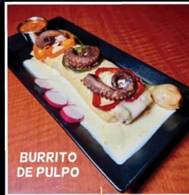
BURRITO DE PULPO