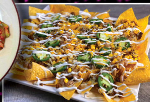
NACHOS EL SANTO