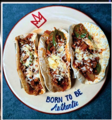
TACOS DEL NORTE