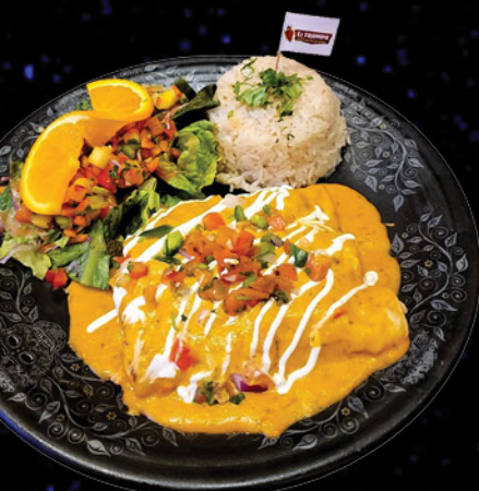
ENCHILADAS LA BAMBA

Three mouthwatering enchiladas topped with our delicious house made salsas, with our touch of Mexican flavors, stuffed with shredded chicken, served with white rice and Mexican salad.