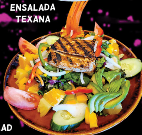
TROPICAL AVOCADO SALAD