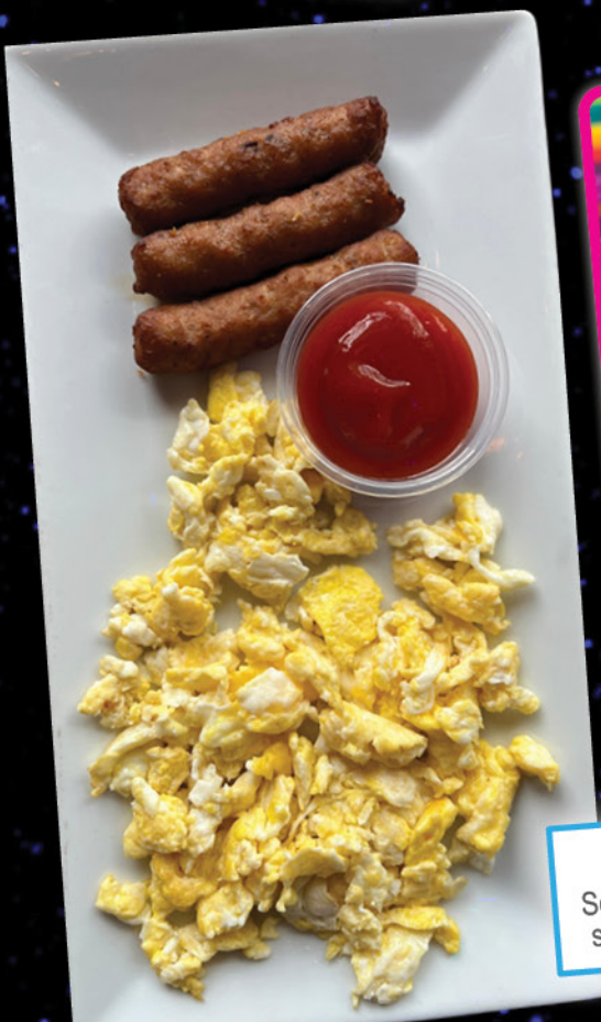
KIDS 13 Scrambled eggs* with sausage links. $5.99