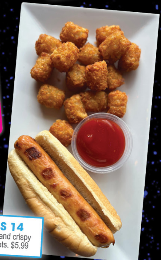
KIDS 14 Hot dog and crispy potato tots. $5.99

*THESE ITEMS ARE COOKED TO ORDER AND MAY BE SERVED RAW OR UNDERCOOKED. CONSUMING RAW OR UNDERCOOKED MEATS, POULTRY, SEAFOOD, SHELLFISH, OR EGGS MAY INCREASE YOUR RISK OF FOODBORNE ILLNESS. BEFORE PLACING YOUR ORDER, PLEASE INFORM YOUR SERVER IF A PERSON IN YOUR PARTY HAS A FOOD ALLERGY. 18% GRATUITY MAY BE ADDED TO PARTIES OF 6 OR MORE