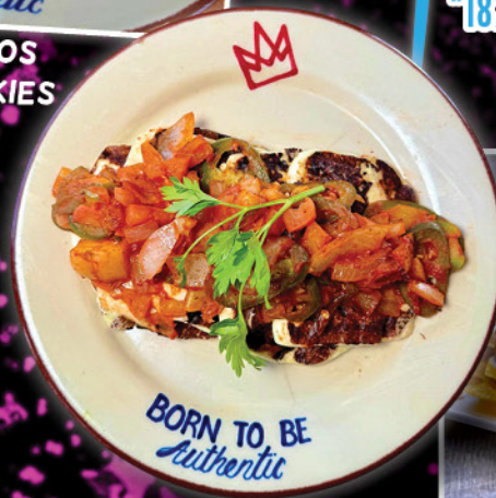
QUESO PANELA ASADO

Garden salad, bell peppers, tomatoes, red onions, cucumbers and shredded cheese.