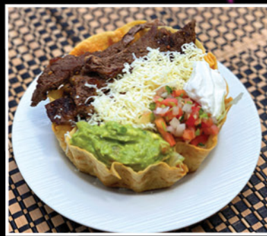
STEAK TACO SALAD