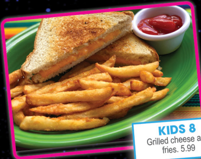
KIDS 8 Grilled cheese and fries. 5.99