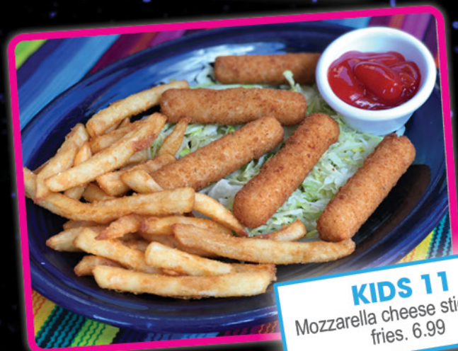
KIDS 11 Mozzarella cheese sticks and fries. 6.99