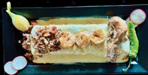
BURRITO EL REY