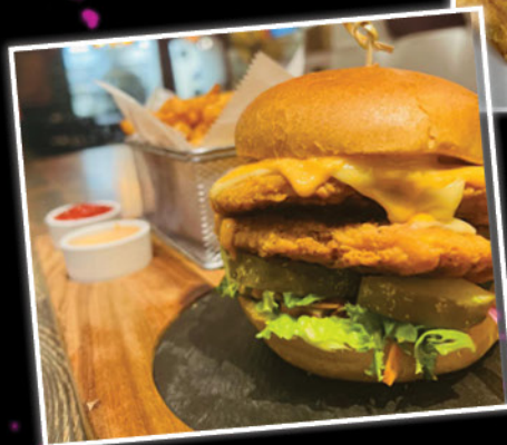
BURGER "LA PELIGROSA"