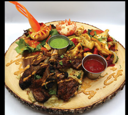
JS LAMB CHOPS