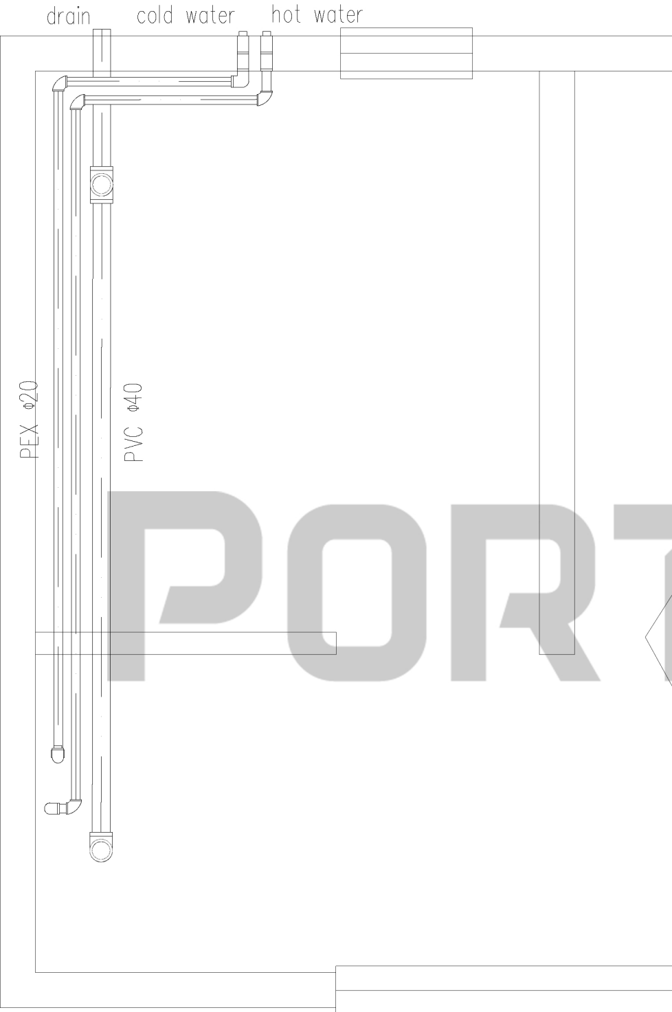
Level plan of water supply and drainage