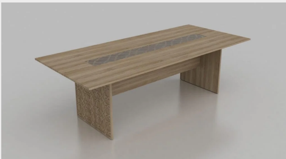
Table ranges from a 6 to 14 seater unit.

Strong Wood Colours and a curvaceous edge are the hallmarks of this table. We pay homage to classical furniture design elements with a range of vibrant laminates to match.