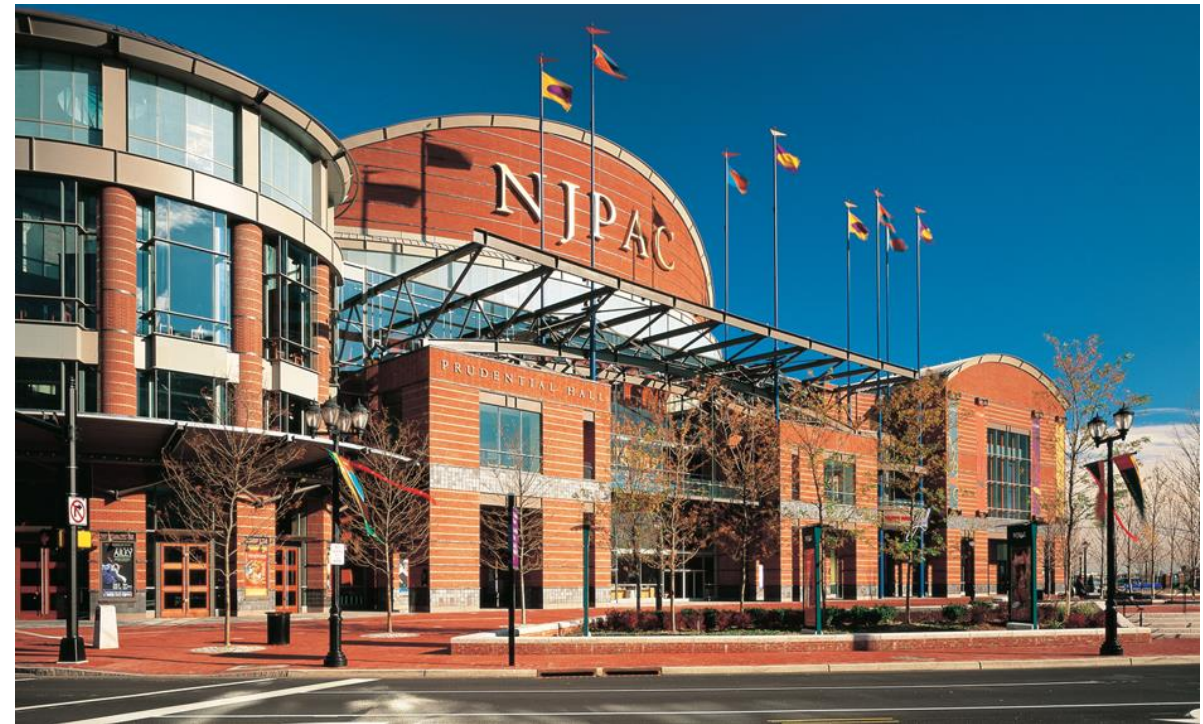
NJ Performing Arts Center (NJ PAC) 1 Center St, Newark, NJ 07102