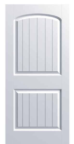
2 Pnl. Arch W/ Grooves