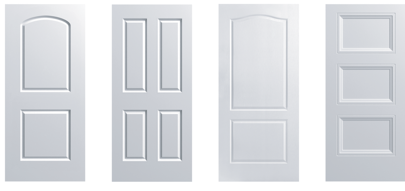
2 Panel Roman