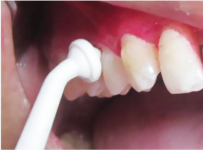
Fig. 1: Ozonated water irrigation on left side