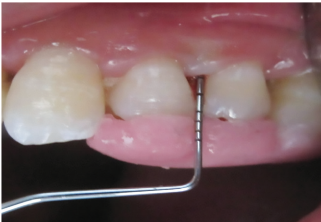
Fig. 5: Probing pocket depth and clinical attachment level at 3 months in group I (Chlorhexidine)