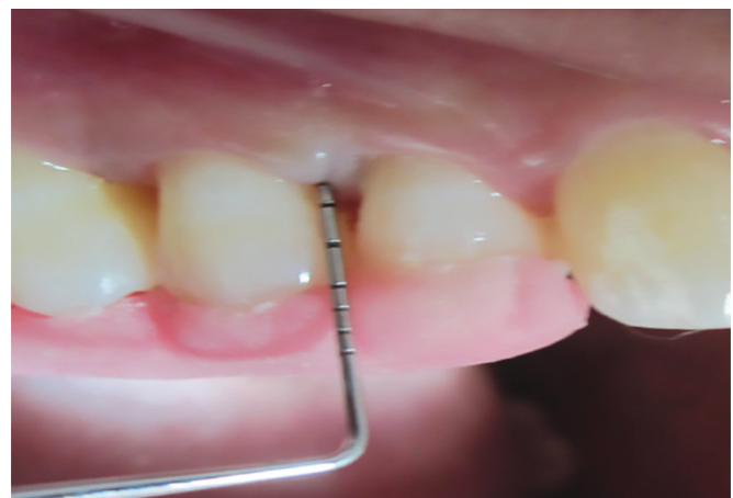
Fig. 6: Probing pocket depth and clinical attachment level at 3 months in group II (Ozonated water)