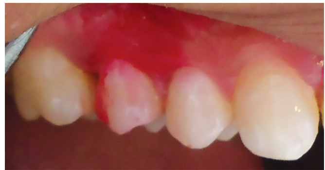
Fig. 4: Plaque score at 3 months in group II (ozonated water)