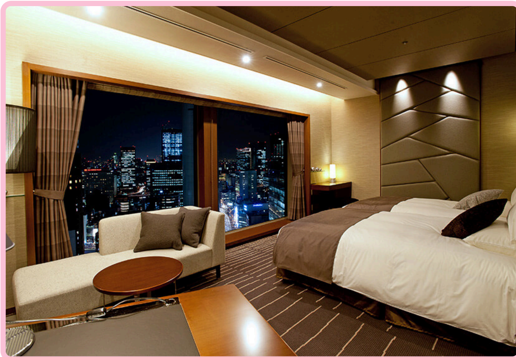
Hotel Granvia Osaka (pictured left)

Our group will be staying at Hotel Granvia Osaka and Tokyo Bay Shiomi Prince Hotel . Breakfast is included. Most rooms in our block are for double occupancy. However, we will check availability for families with children who need triple or quad occupancy rooms.