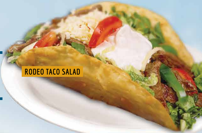
RODEO TACO SALAD

Three tacos stuffed with our delicious chorizo sausage and served with flour or corn tortillas - 12.99