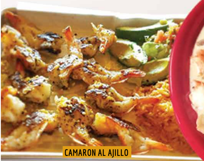
CAMARON AL AJILLO

Served with lettuce, pico de gallo, avocado, tortillas , rice and beans - 16.99