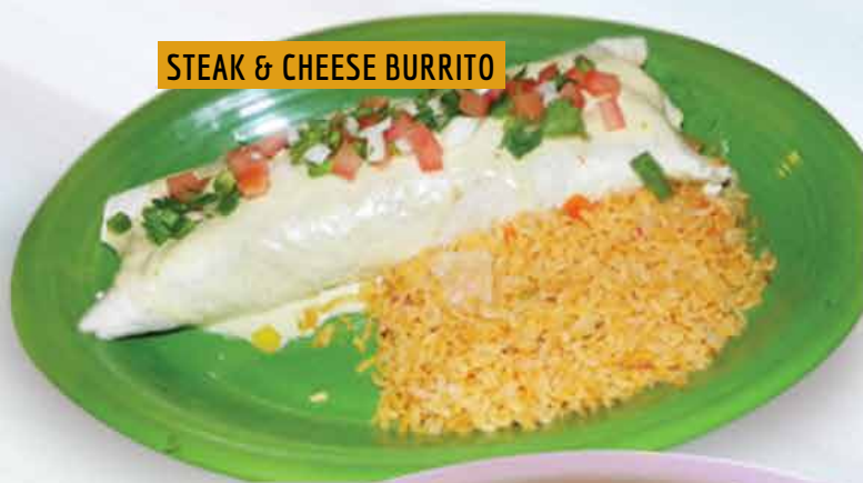
STEAK &amp; CHEESE BURRITO

Grilled chicken sautéed together with carrots, broccoli, mushrooms and topped with nacho cheese sauce, beans, rice and three tortillas - 14.99