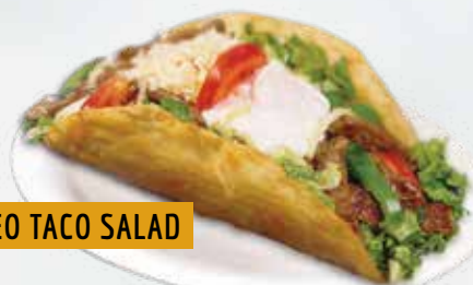
RODEO TACO SALAD