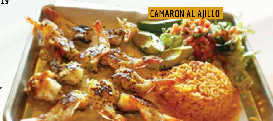
CAMARON AL AJILLO

Tasty deep-fried shrimp served with lettuce, rice and pico de gallo - 19