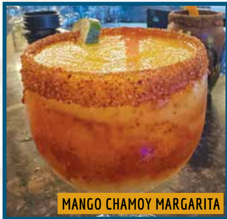
MANGO CHAMOY MARGARITA