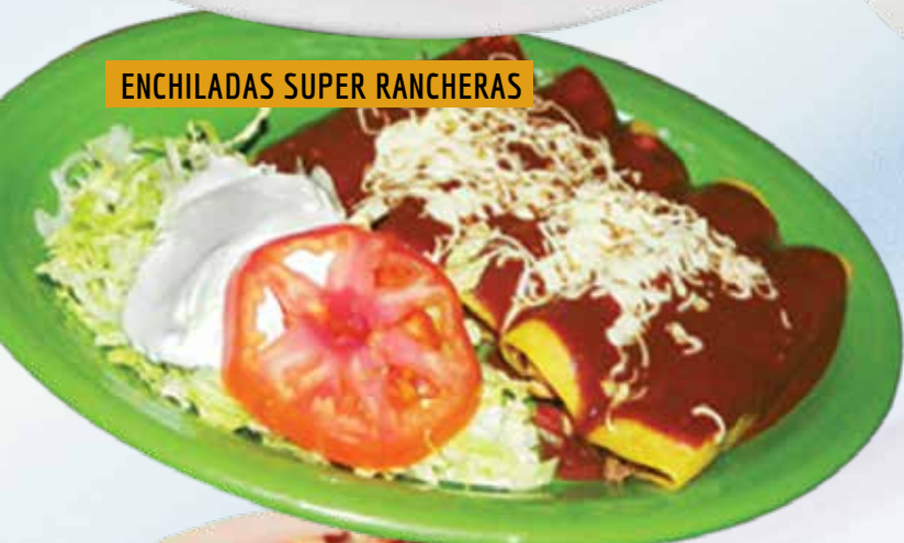
ENCHILADAS SUPER RANCHERAS