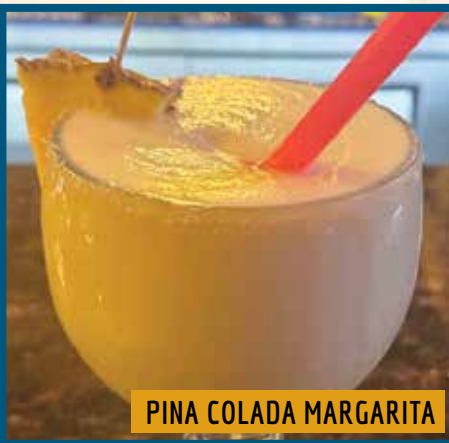
PINA COLADA MARGARITA