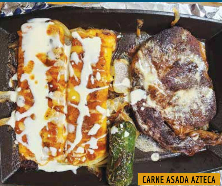
CARNE ASADA AZTECA