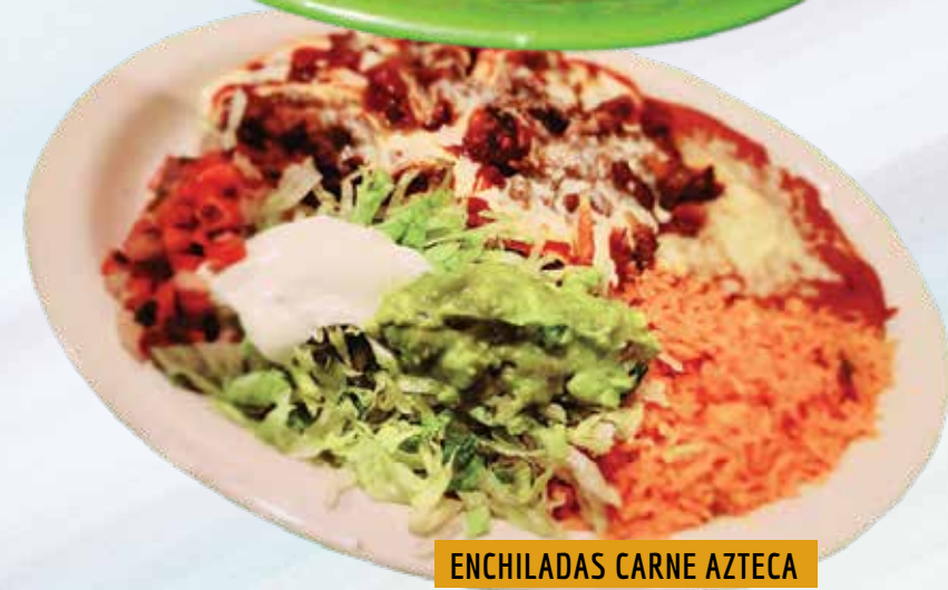
ENCHILADAS CARNE AZTECA