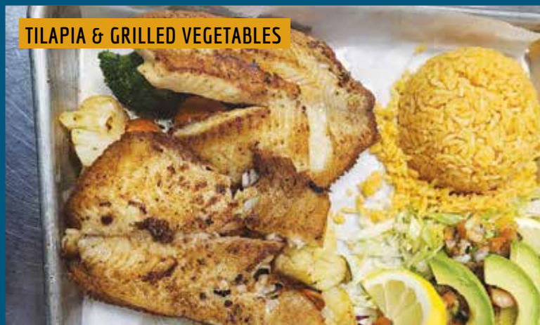
TILAPIA & GRILLED VEGETABLES