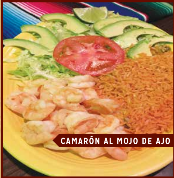
CAMARÓN AL MOJO DE AJO

An authentic dish of fried tortilla chips blended with our special verde sauce, topped with chicken or beef tips and plenty of cheese 12.99 Add Eggs + 1.99