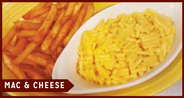
MAC & CHEESE