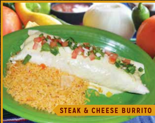
STEAK & CHEESE BURRITO