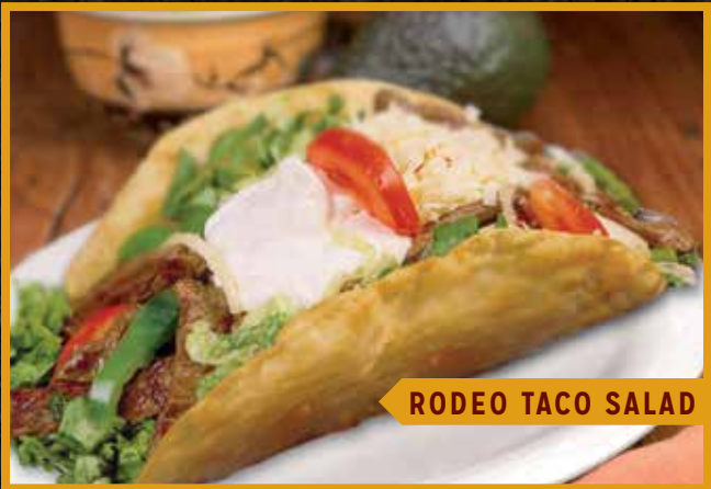
RODEO TACO SALAD