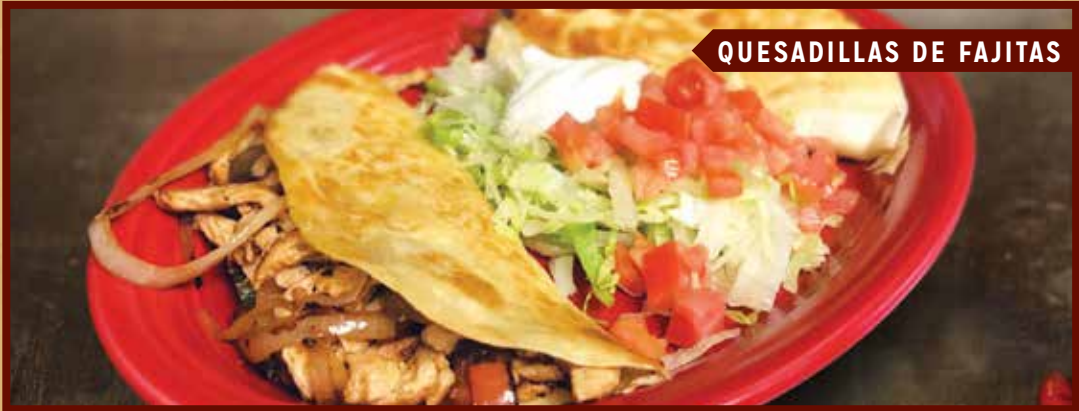
QUESADILLAS DE FAJITAS