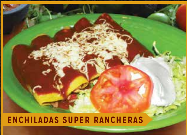
ENCHILADAS SUPER RANCHERAS

Three chicken enchiladas topped with our homemade green sauce. Served with rice and beans