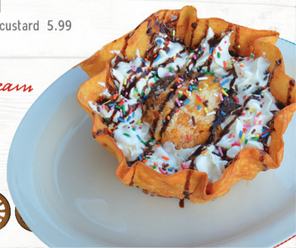
Fried Ice Cream

*NOTICE: COOKED TO ORDER. CONSUMING RAW OR UNDERCOOKED MEATS, POULTRY, SEAFOOD, SHELLFISH OR EGGS MAY INCREASE YOUR RISK OF FOOD BORNE ILLNESS, ESPECIALLY IF YOU HAVE CERTAIN MEDICAL CONDITIONS