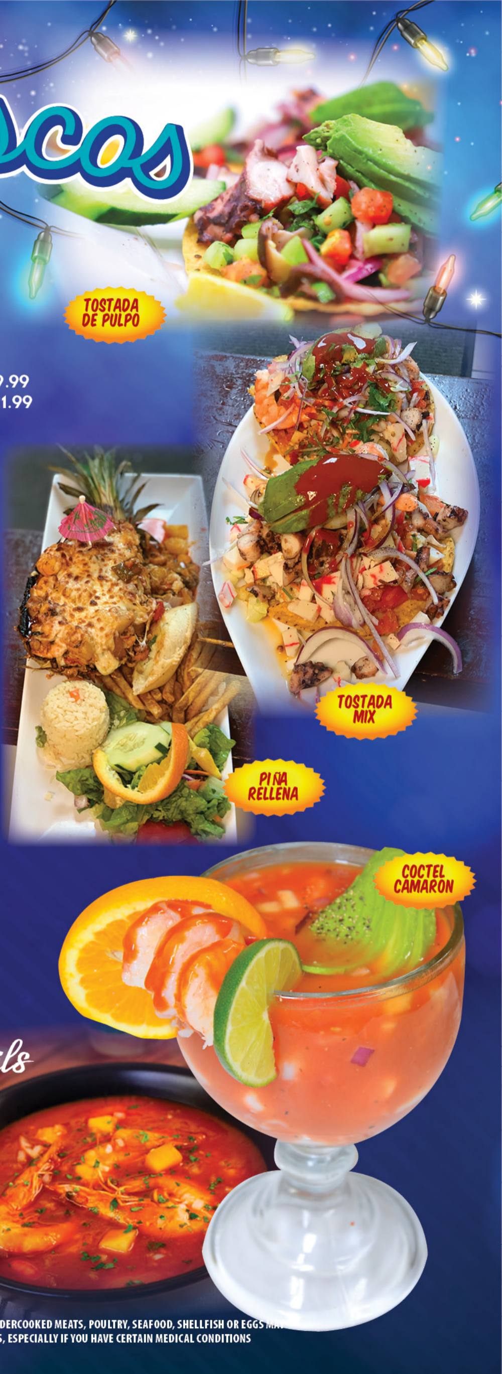
TOSTADA DE PULPO

Camaron, pulpo, y callo de hacha Shrimp, octopus and scallops