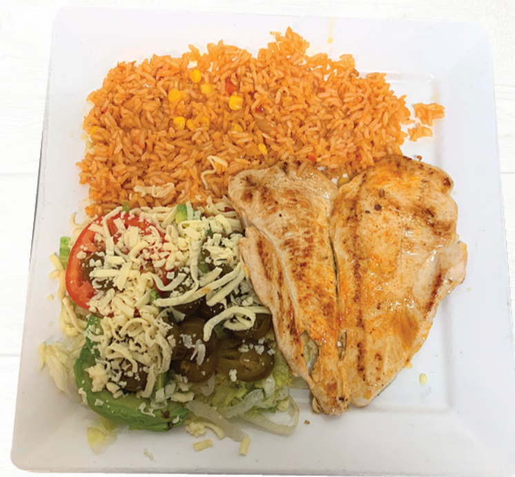
Grilled Chicken Breast