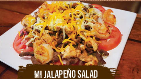
MI JALAPEÑO SALAD