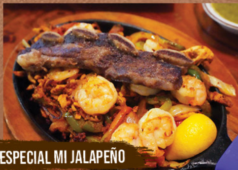
ESPECIAL MI JALAPEÑO

Chicken, steak, chorizo, mushrooms and onions 15.49