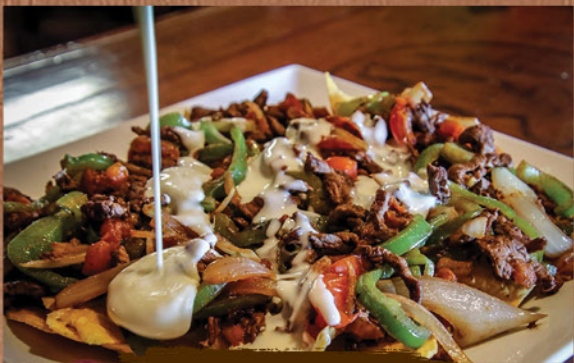
NACHOS FAJITA STEAK

Grilled chicken, steak, shrimp on a bed of lettuce, bell peppers, tomato, onion and cheese. la ensalada