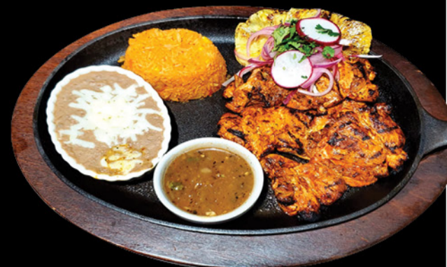
POLLO AL PASTOR