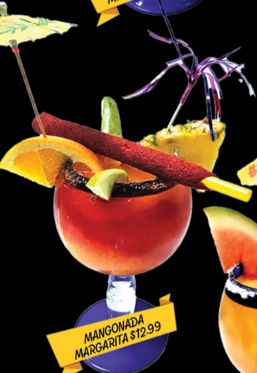
MANGONADA MARGARITA $12.99