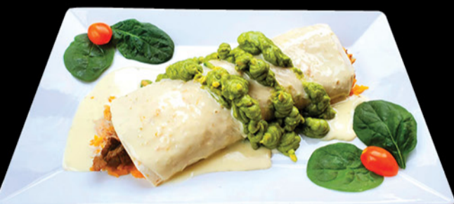
BIG BURRITO CALIFORNIA