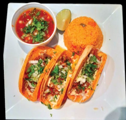
TACOS DE BIRRIA