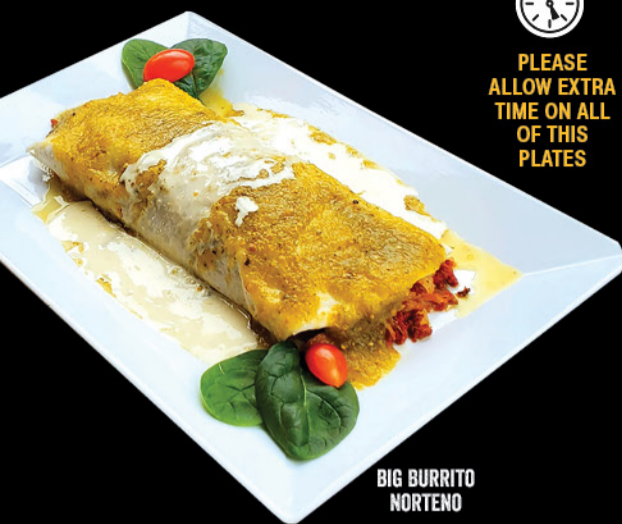
BIG BURRITO NORTENO