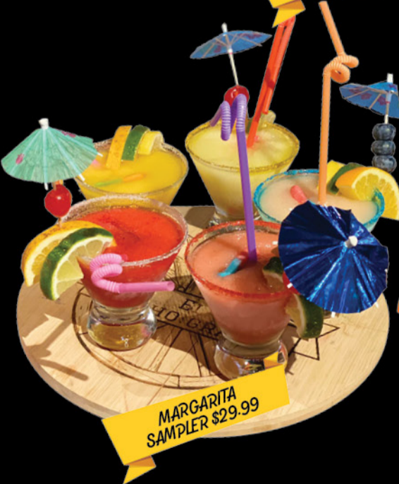
MARGARITA SAMPLER $29.99