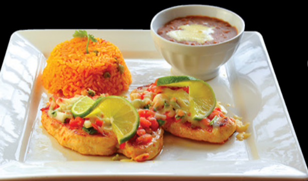
MARGARITA LIME CHICKEN