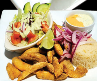
CHICHARRON DE PESCADO