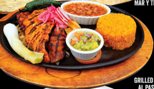
GRILLED PORK AL PASTOR

PLEASE ALLOW EXTRA TIME ON ALL OF THIS PLATES