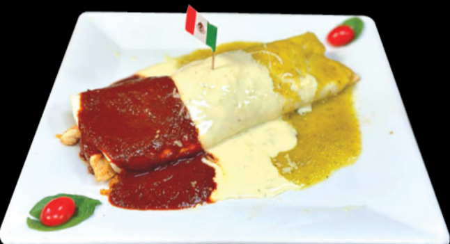
BIG BURRITO MEXICANO