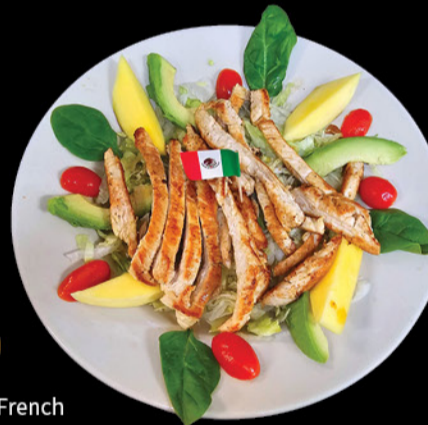
CHICKEN RASPBERRY SALAD

Appetizer portion of shrimp cooked with Guajillo sauce, and onions served with cucumber and tomatoes 19.99