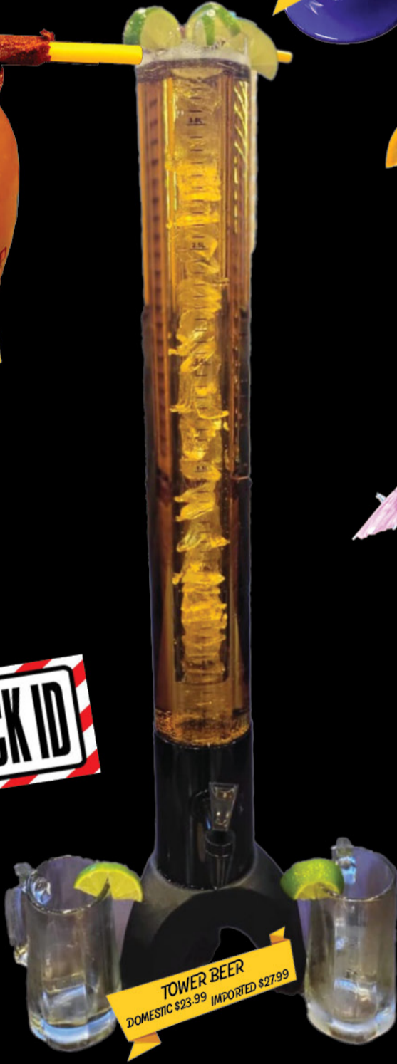
TOWER BEER DOMESTIC $23.99 IMPORTED $27.99