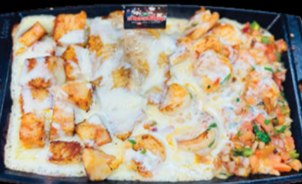
DEL MAR TRIO