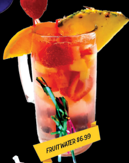
FRUIT WATER $6.99