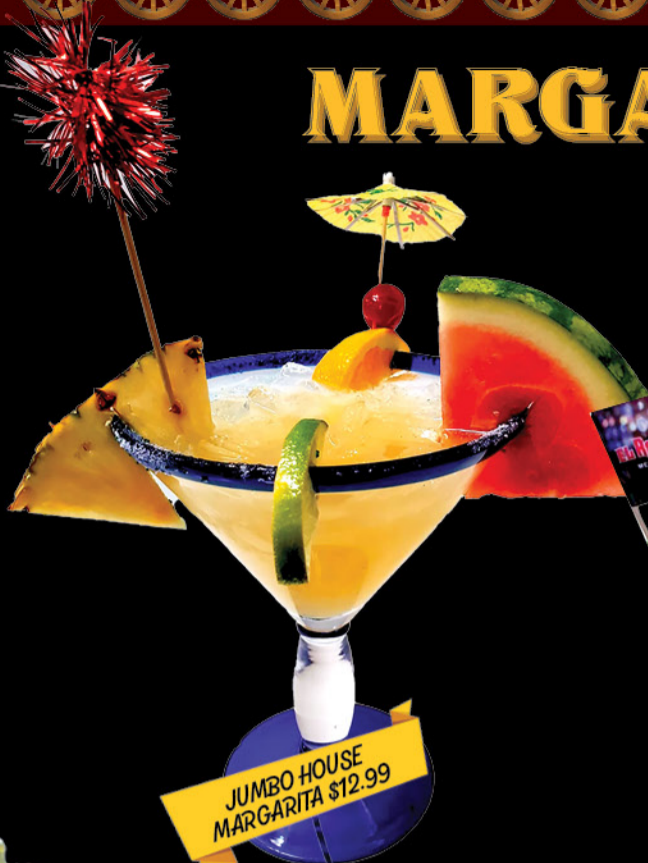
JUMBO HOUSE MARGARITA $12.99