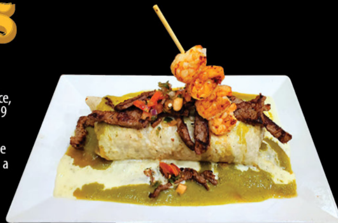
MUCHO MACHO BURRITO

Chimi- Birria Two flour tortillas rolled up and stuffed with beef birria, then covered with cheese sauce, served with rice or beans and guacamole salad 16.99