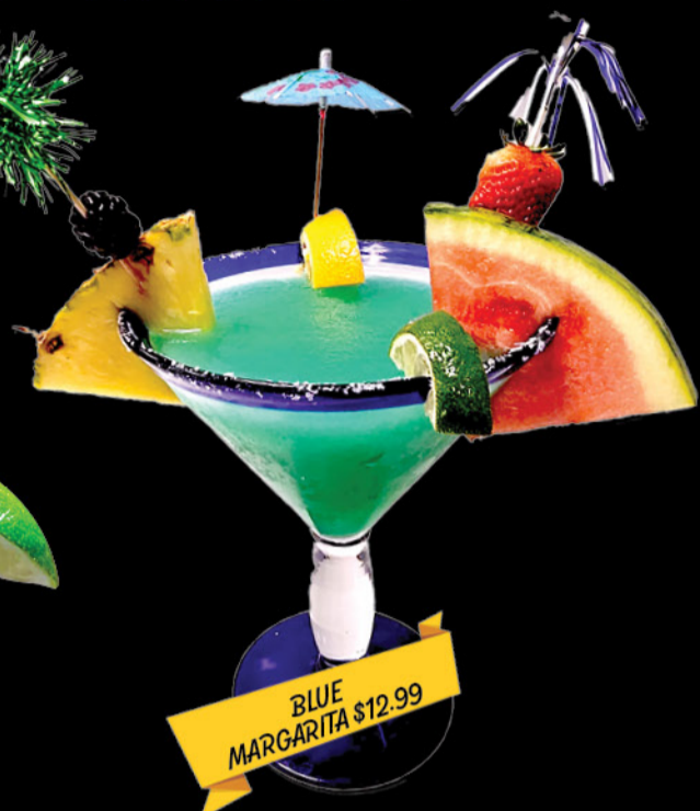
BLUE MARGARITA $12.99