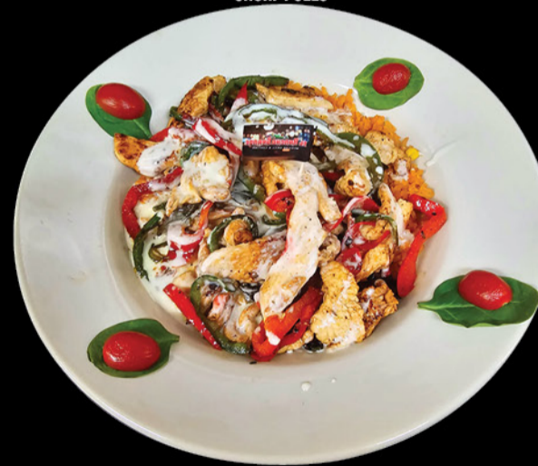
CHICKEN RICE BOWL