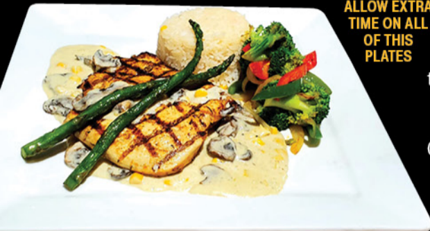
CHICKEN & MUSHROOM SAUCE