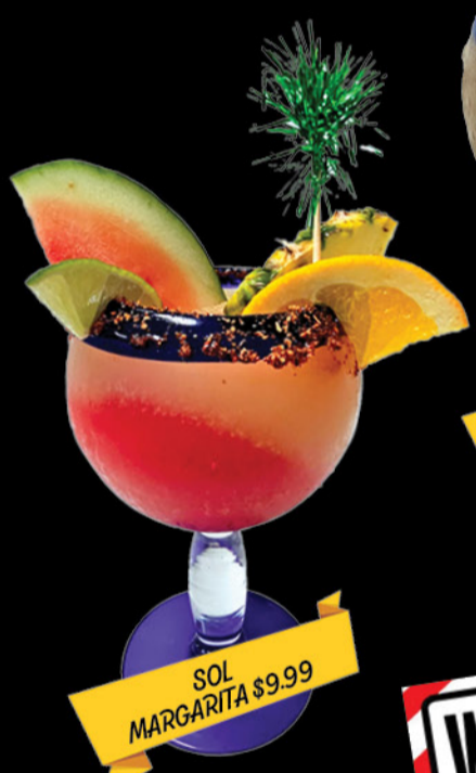
SOL MARGARITA $9.99