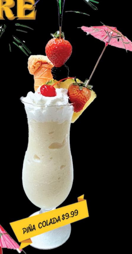
PIÑA COLADA $9.99