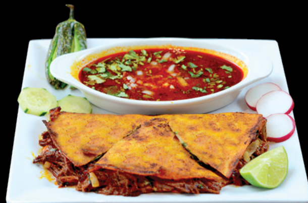
QUESADILLA DE BIRRIA

*NOTICE: FOODS COOKED TO ORDER, CONSUMING RAW OR UNDERCOOKED MEATS, POULTRY, SEAFOOD, SHELLFISH OR EGGS MAY INCREASE YOUR RISK FOR FOOD BORNE ILLNESSES, ESPECIALLY IF YOU HAVE CERTAIN MEDICAL CONDITIONS.