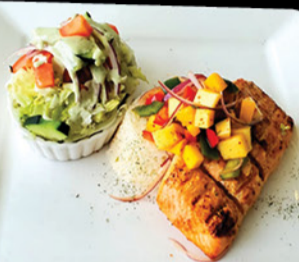
SALMON AL GRILL