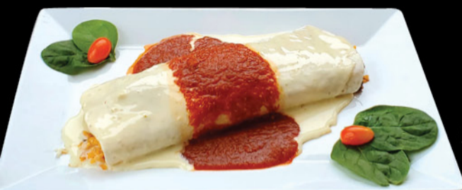
BIG BURRITO RANCHERO