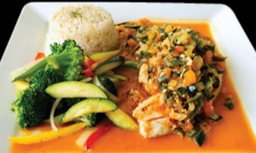
FISH FILLET AND GARLIC