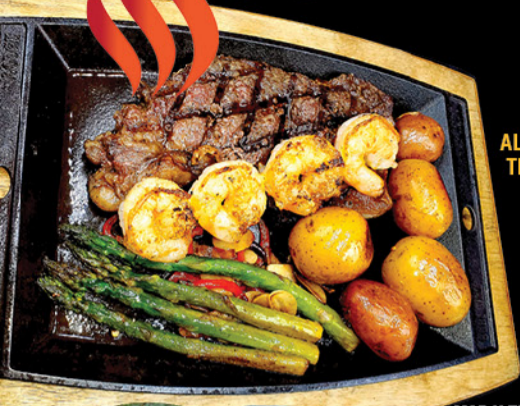
MAR Y TIERRA