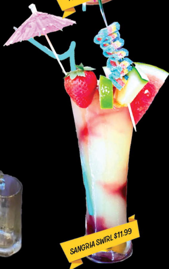
SANGRIA SWIRL $11.99