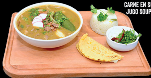
CARNE EN SU JUGO SOUP

Grilled sliced steak, served with chilaquiles in green sauce, two eggs (over easy) and rice 14.50