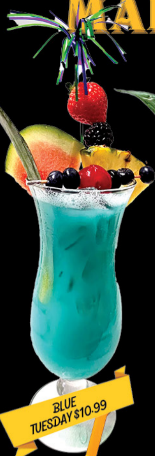
BLUE TUESDAY $10.99