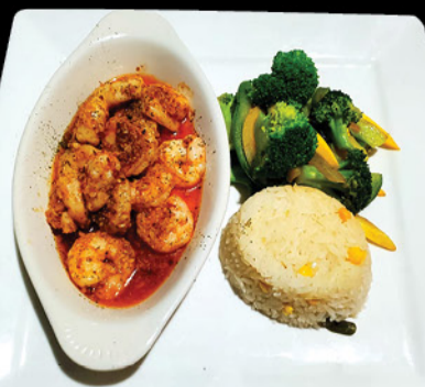
CAMARONES AL AJILLO

Cooked shrimp with onions, tomato, cilantro, jalapeño, cucumber, avocado slices and cocktail sauce 19.99