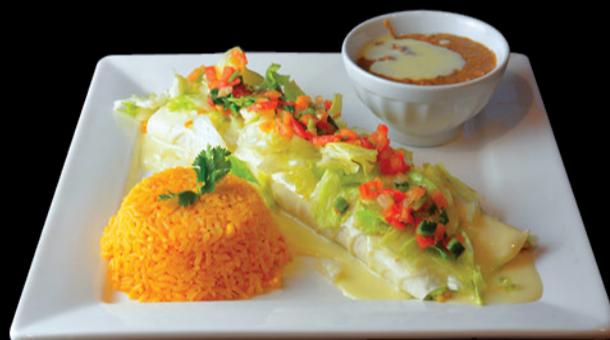
BIG CHEESE STEAK BURRITO