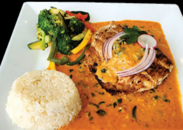
CORVINA DE LUXE

*NOTICE: FOODS COOKED TO ORDER, CONSUMING RAW OR UNDERCOOKED MEATS, POULTRY, SEAFOOD, SHELLFISH OR EGGS MAY INCREASE YOUR RISK FOR FOOD BORNE ILLNESSES, ESPECIALLY IF YOU HAVE CERTAIN MEDICAL CONDITIONS.