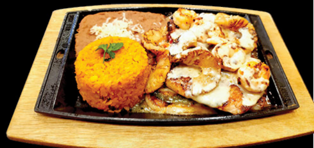
POLLO A LA PARRILLA

Fried whole cornish hen, served with rice, salad and roasted salsa 17.99