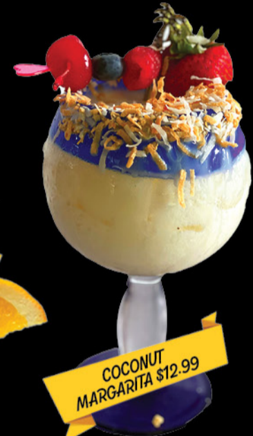
COCONUT MARGARITA $12.99