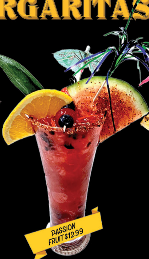
PASSION FRUIT $12.99