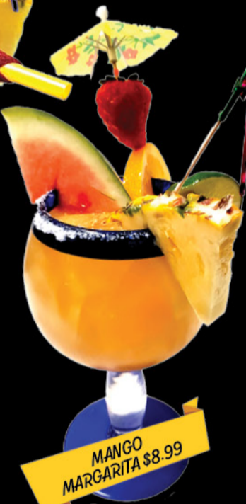
MANGO MARGARITA $8.99