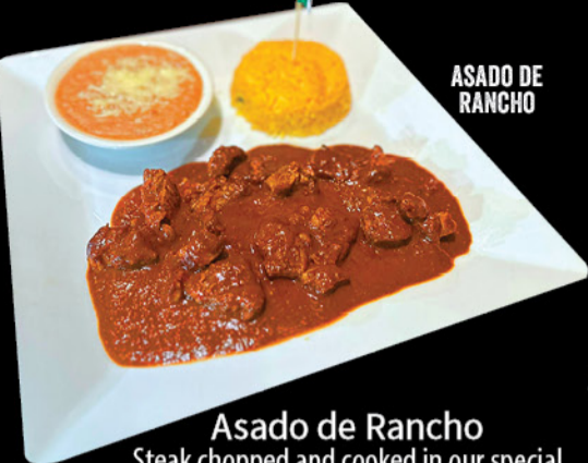
ASADO DE RANCHO