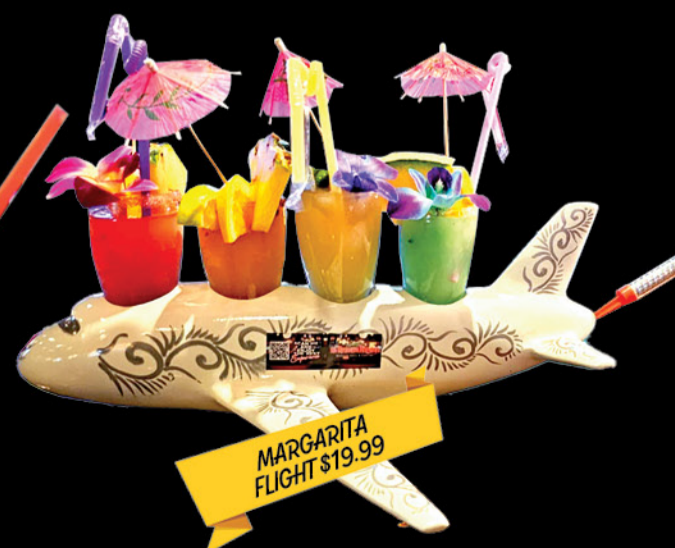
MARGARITA FLIGHT $19.99