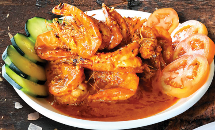
BOTANA CAMARONES KORA