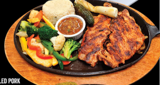
GRILLED PORK LOIN