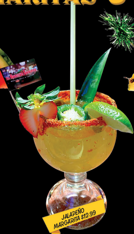
JALAPEÑO MARGARITA $12.99