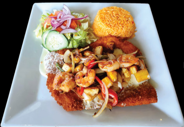
CHICKEN MILANESA TROPICAL