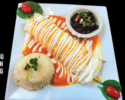
AVOCADO CHICKEN BURRITO

Grilled chicken breast cooked with onions, mushrooms, tomatoes and zucchini, topped with cheese sauce, served with rice and tortillas 11.99