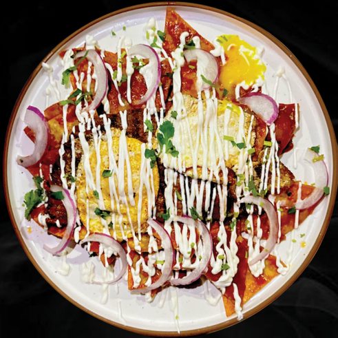
Chilaquiles El Jefe