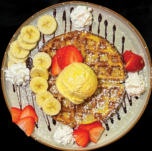
Triple Berry Guava Waffle