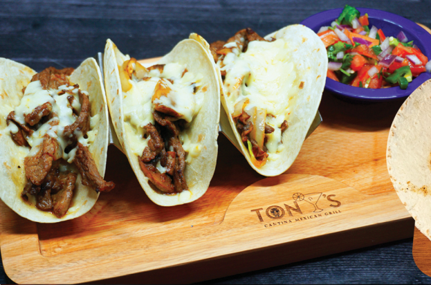
Tacos Al Carbon