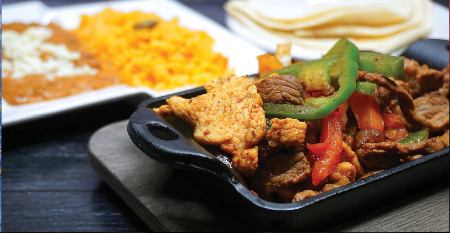
Lunch Fajita Trio