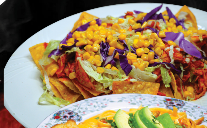
Chicken Tinga Nachos

CHICKEN OAXACA SALAD Grilled chicken Mexican rice, whole black beans, corn, pico de gallo, and red cabbage, served over a bed of lettuce. 16.99