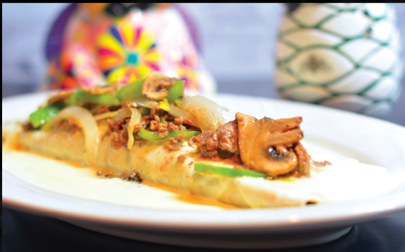
Burrito Philly Steak